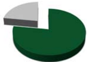
77% of stakes winners rate as "B" or better