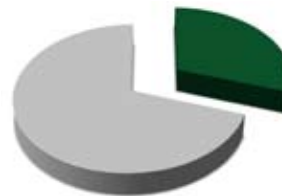
30% of horses rate as "B" or better

Horses rated "B" or better (B to A++) represent just 30% of the entire population, yet three out of four (77%) stakes winners rate "B" or better.