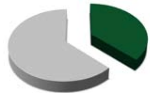
37% of stakes winners are "A" ratings