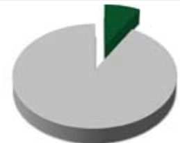
8% of stakes winners have lower ratings

ALAN PORTER , International Pedigree Analyst and codeveloper of TrueNicks states: "In my practical experience, horses that rate a 'B+' or better have a much higher probability of success on the racetrack than horses that rate a 'C' or below."