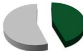
44% of Thoroughbreds rate "C" through "F"

Almost half of Thoroughbreds in general – 44% – are on the low end of the scale (rated "C" through "F"), yet only two in 25 stakes winners (8%) have these lower ratings.