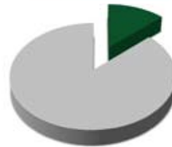
13% of Thoroughbreds are "A" ratings

Only 13% of the entire Thoroughbred population earn "A" ratings (A to A++) while 37% of stakes winners rate as "A"s.