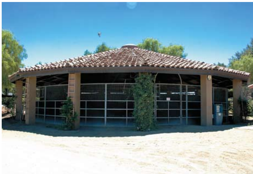
The Equiciser is one of many exercise options at Ballena Vista