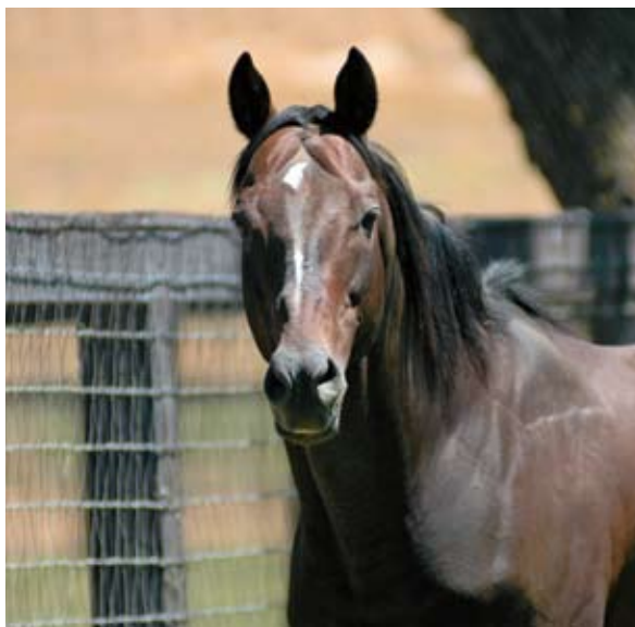
Ballena Vista stallion Sea of Secrets