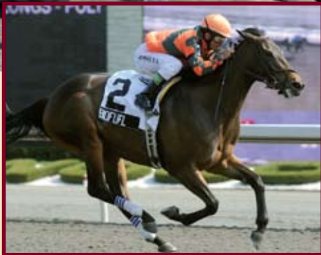
CHAMPION BIOFUEL ($612,227), WINNER OF 3 STAKES IN 2010 AND 2ND IN THE CCA OAKS (G1) AND 3RD IN THE MOTHER GOOSE S. (G1).

A LITTLE WARM ROLLS HOME TO WIN THE GRADE 2 JIM DANDY STAKES AT SARATOGA. THE 3Y0 COLT HAS WON OR PLACED IN 8 OF 10 CAREER STARTS TO EARN $638,880.