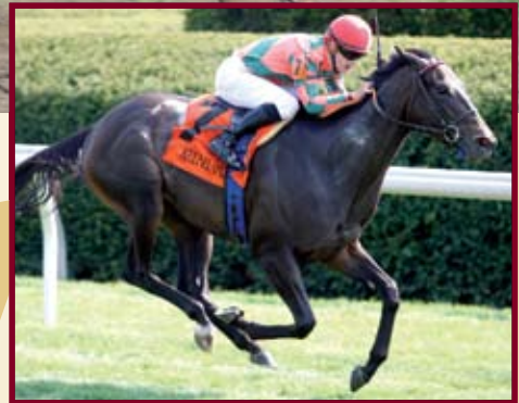
CHECK THE LABEL ($341,227), WINNER OF THREE GRADED STAKES IN 2010, INCLUDING THE SANDS POINT STAKES (G2) AT BELMONT PARK AND KEENELAND'S APPALACHIAN S. (G3).

A LITTLE WARM ROLLS HOME TO WIN THE GRADE 2 JIM DANDY STAKES AT SARATOGA. THE 3Y0 COLT HAS WON OR PLACED IN 8 OF 10 CAREER STARTS TO EARN $638,880.