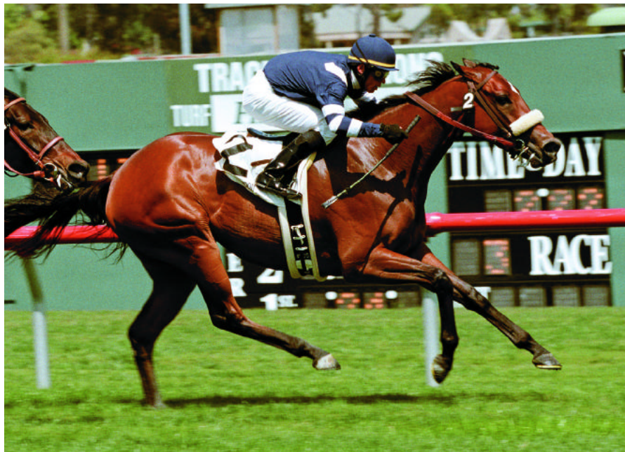
BENOIT & ASSOCIATES