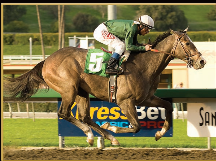
BENOIT & ASSOCIATES

"The Pamplémousse had more raw ability than any horse I ever trained. Not only was he fast, but he could carry his speed a long way. I really believed he had Classic potential, it was a travesty that he never had a chance to prove it."