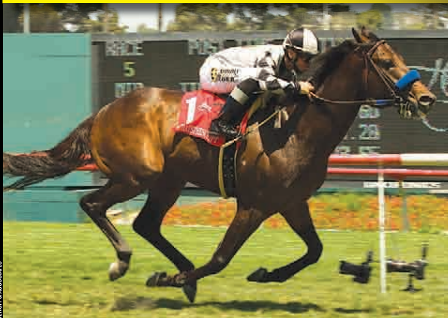
BENOIT & ASSOCIATES

First year sire and multiple Graded SW WHATSTHESCRIPT attracted such an outstanding book of mares that he ranked #1 among the Nation's 'Under $5,000' stallions.