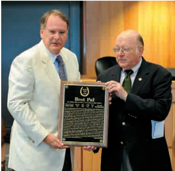
BENNETT & ASSOCIATES