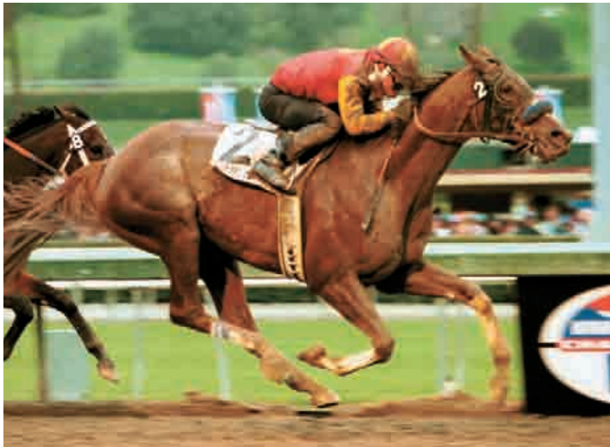
General Challenge winning the Santa Anita Handicap in 2000

war, soap flakes came in drums. This was before laundry detergent.”