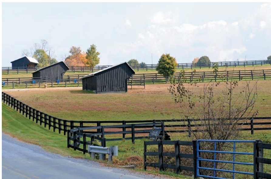
Small paddocks help the yearlings thrive

and took the position as racetrack trainer, lightening his father's load and adding another dimension to the operation. He's won 43 races at Penn National this year, good for seventh in the standings, from just 197 starters (through Dec. 8).