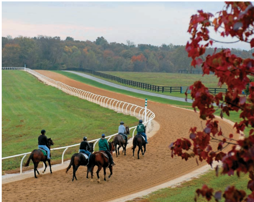
Horses get their early lessons on Sylmar’s training track

now manages the yearling operation. She uses old-school methods such as driving with long lines, having turnout time with a pad and surcingle, and walking/jogging in the shedrow.