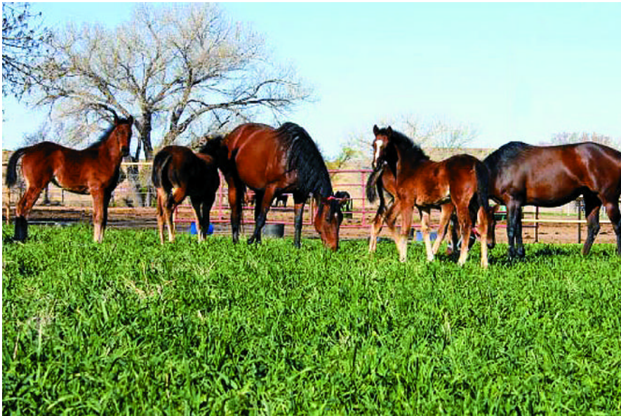
The Snyders have a broodmare band of 25

*A-E and COMPARABLE INDEX: The lifetime Average-Earnings Index indicates how much purse money the progeny of one sire has earned, on the average, in relation to the average earnings of all runners in the same years; average earnings of all runners in any year is represented by an index of 1.00. The Comparable Index indicates the average earnings of progeny produced from mares bred to one sire, when these same mares were bred to other sires. Only 32% of all sires have a lifetime AEI higher than their mares Comparable Index.