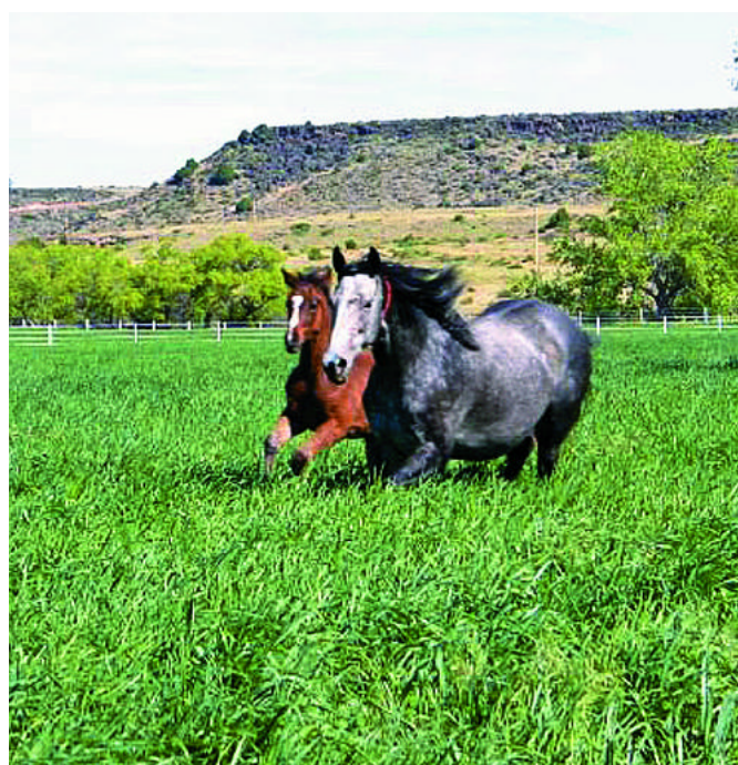
Horses love Cedar Creek's lush fields