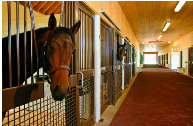
Some of the residents at the Pegasus Training and Rehabilitation Center