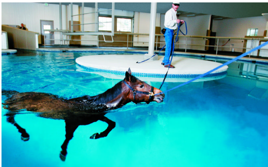
A swimming pool is one of the exercise options at the Pegasus facility

in a house on the property, as does Dedomenico.