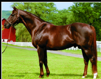
KEY CONTENDER | Private Fit to Fight - Key Witness NY's leading active sire by percentage of 2010 stakes winners from starters