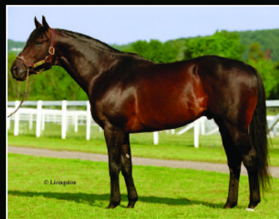
WESTERN EXPRESSION | $5,000 Gone West - Tricky Game A perennial leading NY sire with 16 stakes horses and 13% winners of over $100,000

Breeding | Boarding | Sales Prep | Lay-Ups