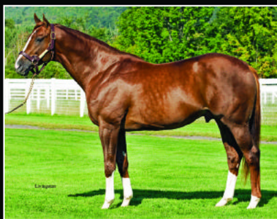
STONESIDER | $3,000 Giant's Causeway - Added Gold A leading sales sire with both crops First 2YO's are already getting rave reviews