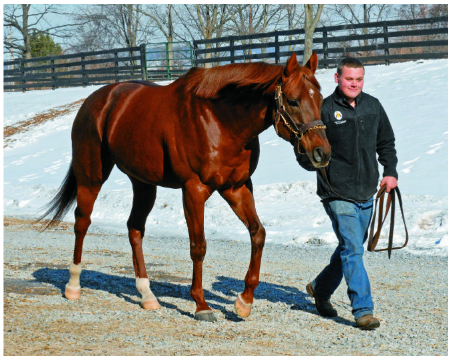
Smarty Jones makes his way into the Pennsylvania stallion market