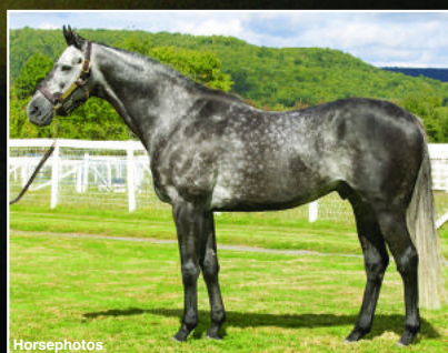
COSMONAUT | $5,000 Lemon Drop Kid - Cosmic Fire Multiple Graded Stakes Winning Millionaire & his sire's leading son at stud