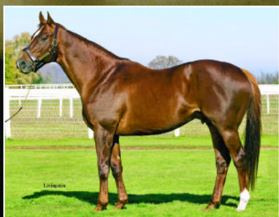
CONGAREE | $7,500 Arazi - Mari's Sheba Sired the #1 Yearling by a 2010 NY Sire, $95,000 filly KeeSept