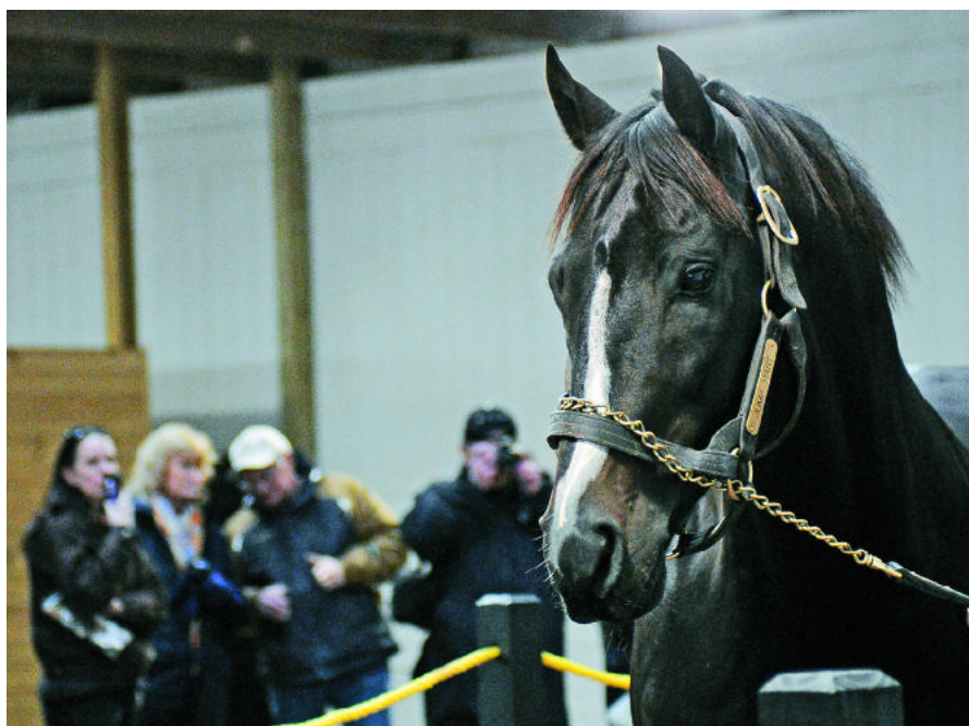
Jump Start was one of Pennsylvania's leading sires in 2010

Jump Start had been Ghost Ridge's reigning stallion star. By A.P. Indy, Jump