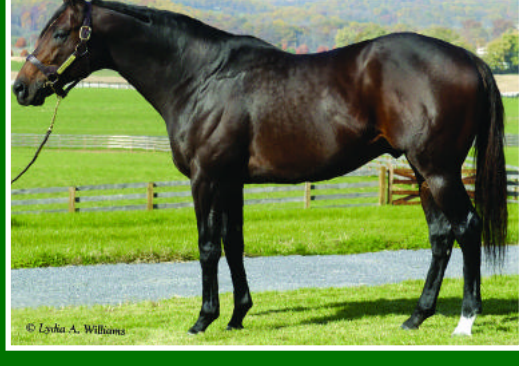
A.P. INDY—PROSPECTORS DELITE, by Mr. Prospector

Nominated to Maryland Million & Breeders' Cup