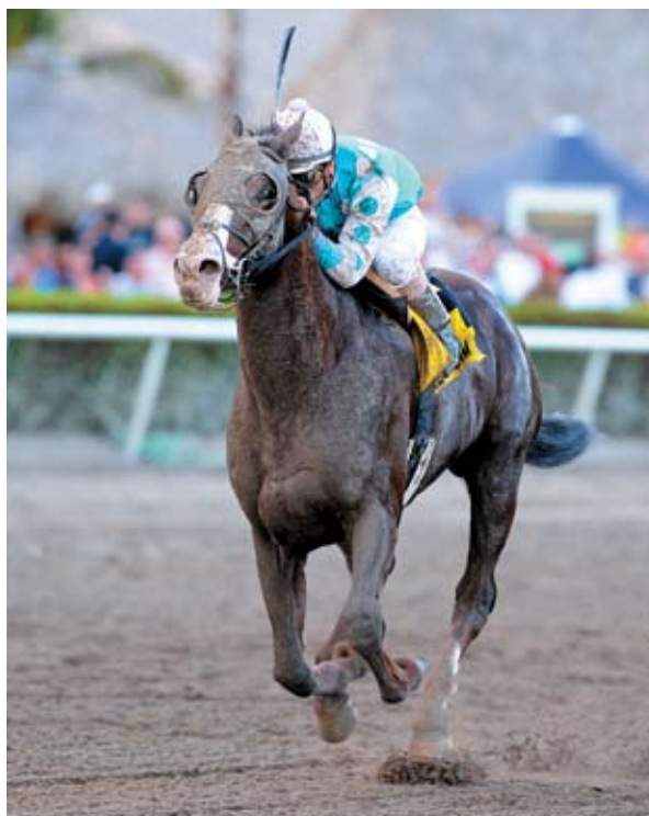
Giant Oak makes a smashing 2011 debut in the Donn Handicap