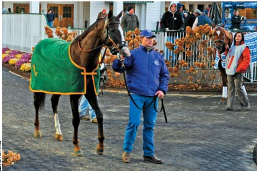
Giant Oak cuts an imposing figure in the paddock at Churchill Downs