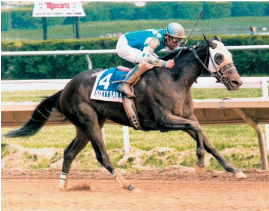
FOUR FOOTED PHOTOS

*A-E and COMPARABLE INDEX: The lifetime Average-Earnings Index indicates how much purse money the progeny of one sire has earned, on the average, in relation to the average earnings of all runners in the same years; average earnings of all runners in any year is represented by an index of 1.00. The Comparable Index indicates the average earnings of progeny produced from mares bred to one sire, when these same mares were bred to other sires. Only 32% of all sires have a lifetime AEI higher than their mares Comparable Index.