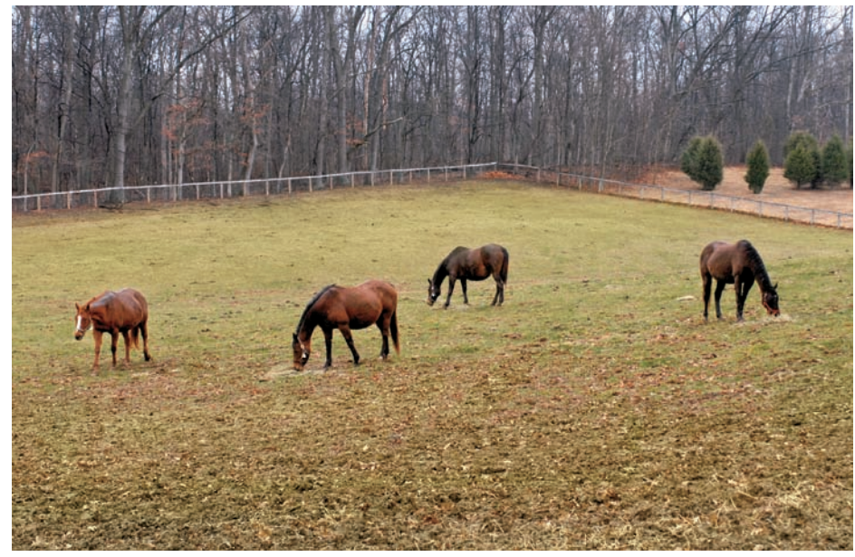
Mares graze at the 40-acre Buckstud Farm near Charles Town, W.Va.