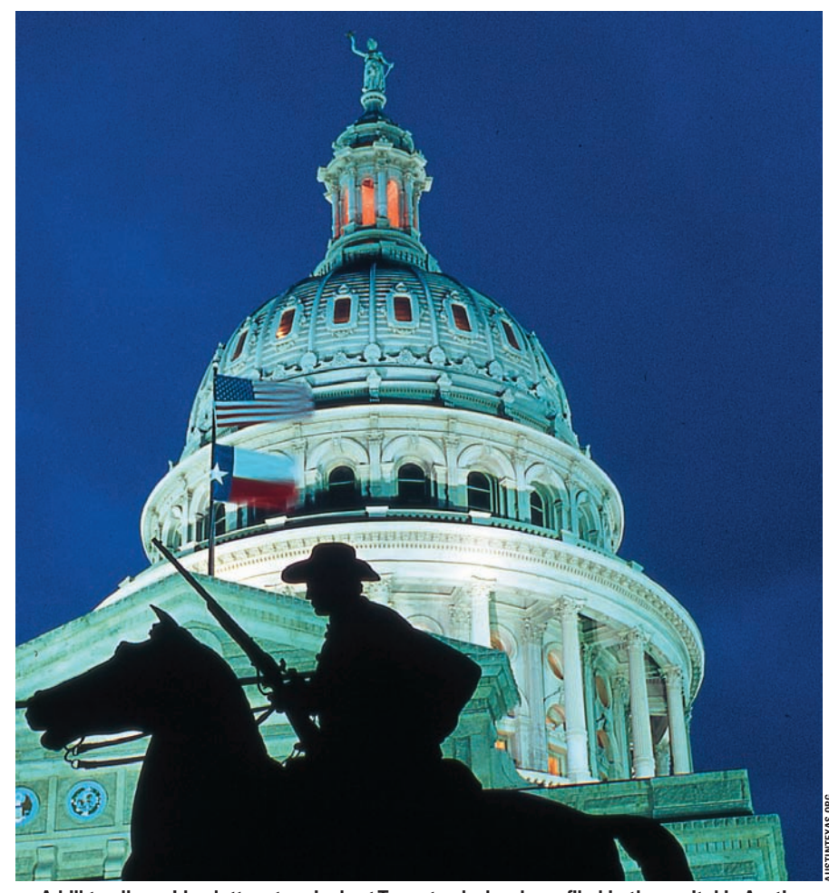
A bill to allow video lottery terminals at Texas tracks has been filed in the capitol in Austin

The Texas horse industry lives and dies by odd-numbered years. The Lone Star State is one of the few states whose legislatures only meet biennially, and when lawmakers do come together in Austin, it's for only 140 days. To Thoroughbred horsemen, those 19 months between sessions can seem endless and hopeless as an increasing amount of money bleeds out of Texas and into the slot machines fueling purses in Louisiana, Oklahoma, and New Mexico.