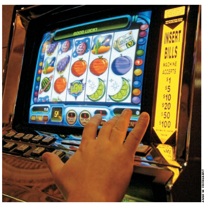
Revenue from VLTs would bolster purses for Thoroughbreds in Texas

At the same time, Texas also must deal with a significant budget deficit. According to the state comptroller's office, Texas'