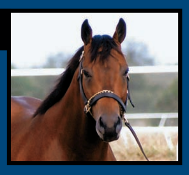
Standing at Asmussen Horse Center, Laredo, Texas

(Storm Boot/Primistal) 2010's #2 Leading Freshman Sire in Texas Four 2YO winners, three first time out, incl. SW LADY PRIMAL, FAR TOO PRIMAL at Lone Star, and PRIMAL KITTEN at Philadelphia. Second in her debut, PRIMAL POINT won next time out at Churchill Downs. Precocious winners by a precocious sire who was a Graded SW 2YO at Belmont. $1,500 LF