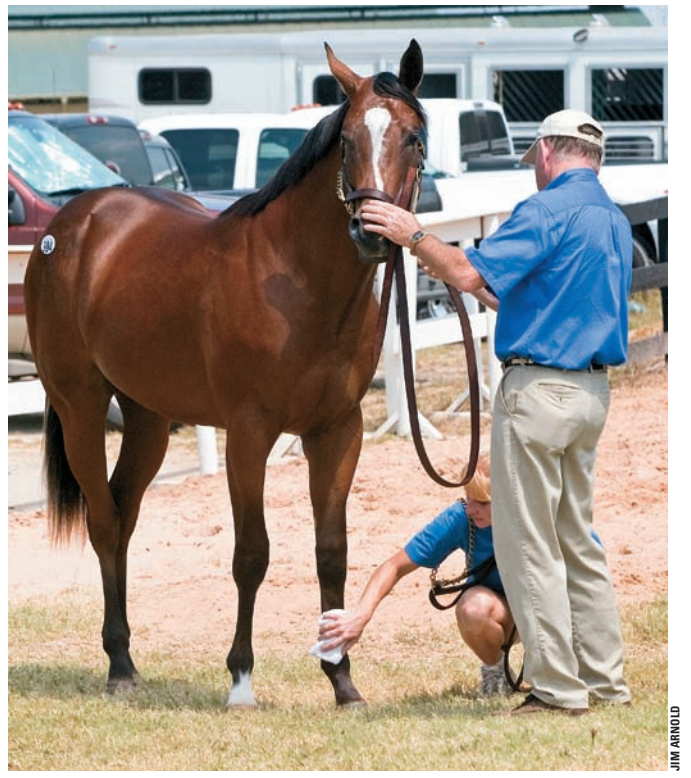
Fasig-Tipton Texas 2-year-old sale is April 5

Randy Blair • 675 W. 470 • Pryor, OK 74361 (918) 825-4256 • Toll Free (866) 233-4256 • Cell (918) 271-2266 Fax (918) 825-4255 • Email: randyblair@mightyacres.com Visit us at www.MightyAcres.com