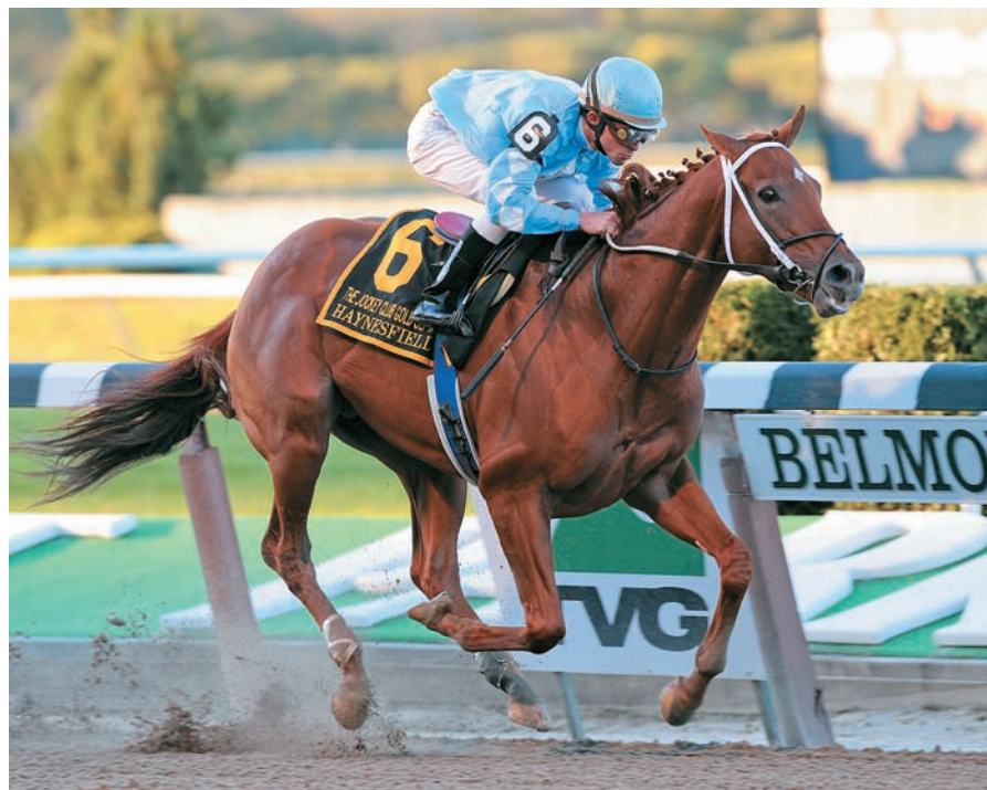
New York-bred Haynesfield wins the Jockey Club Gold Cup

It appears 2011 will be a payback year of sorts for New York breeders and New York racing in general. After a 10-year wait, video lottery terminals should be operating at Aque-