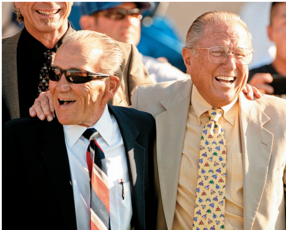
DEWITT & ASSOCIATES