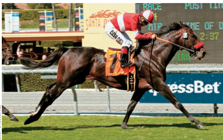
Above: Old English Rancho stallion Lucky Mel; Below, Acclamation, Old English Rancho's three-time grade I winner in Southern California in 2011

Sanger area in the mid-1960s and kept yearlings there from about 1970.