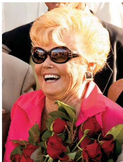
BENNETT & ASSOCIATES