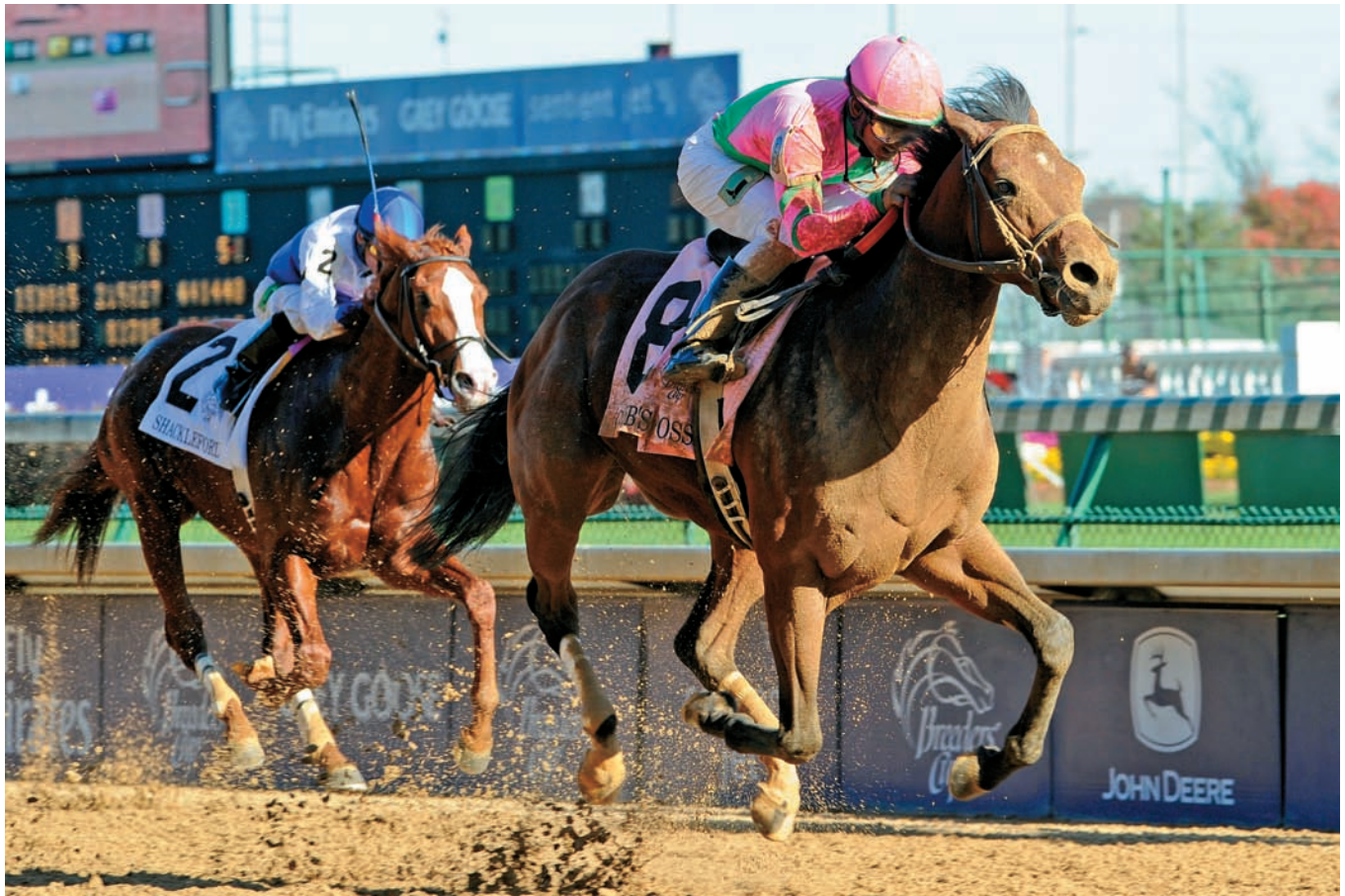
Caleb's Posse wins the Breeders' Cup Mile decisively