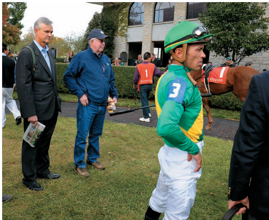
Dobson sizes up the competition during the Keeneland fall meet

AVERAGE-EARNINGS INDEX and COMPARABLE INDEX: Lifetime AVERAGE-EARNINGS INDEX indicates how much purse money the progeny of one sire has earned in relation to the average earnings of all runners in the same years; average earnings of all runners in any year is represented by an index of 1.00; COMPARABLE INDEX indicates the average earnings of progeny produced from mares bred to one sire, when these same mares were bred to other sires. Only 32% of all sires have a lifetime AVERAGE-EARNINGS INDEX higher than their mares' COMPARABLE INDEX.