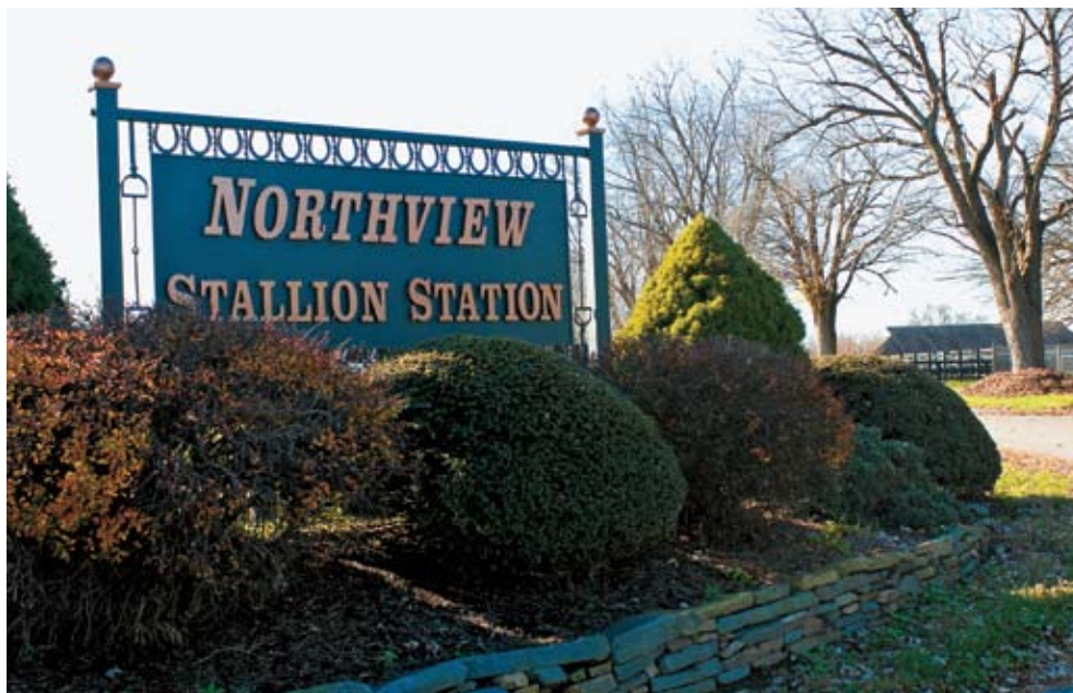
With Pennsylvania going strong, the team at Northview hopes the market in Maryland is on the improve

For Love and winner of the Pennsylvania Derby (gr. II) who is the third-leading second-crop sire in the state this year; Medallist, a multiple graded stakes-winning son of Touch Gold and a top-10 sire in the state; and Silver Train, winner of the 2005 TVG Breeders' Cup Sprint (gr. I) and the 2006 Metropolitan Handicap (gr. I). Silver Train, who began his stud career at Vinery in Kentucky, is the runaway leading second-crop sire by progeny earnings and by winners—his 74 winners so far this year is nearly double that of the second-place sire.