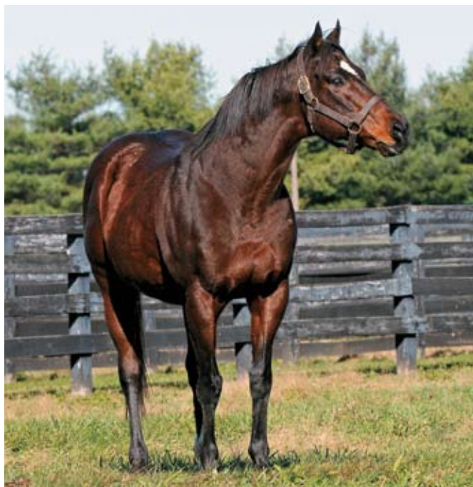
Perennial leading Maryland sire Not For Love

AVERAGE-EARNINGS INDEX and COMPARABLE INDEX : Lifetime AVERAGE-EARNINGS INDEX indicates how much purse money the progeny of one sire has earned in relation to the average earnings of all runners in the same years; average earnings of all runners in any year is represented by an index of 1.00; COMPARABLE INDEX indicates the average earnings of progeny produced from mares bred to one sire, when these same mares were bred to other sires. Only 32% of all sires have a lifetime AVERAGE-EARNINGS INDEX higher than their mares' COMPARABLE INDEX .