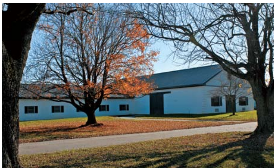
The stallion barn at the Maryland division was home to Northern Dancer

*A-E and COMPARABLE INDEX: The lifetime Average-Earnings Index indicates how much purse money the progeny of one sire has earned, on the average, in relation to the average earnings of all runners in the same years; average earnings of all runners in any year is represented by an index of 1.00. The Comparable Index indicates the average earnings of progeny produced from mares bred to one sire, when these same mares were bred to other sires. Only 32% of all sires have a lifetime AEI higher than their mares Comparable Index.