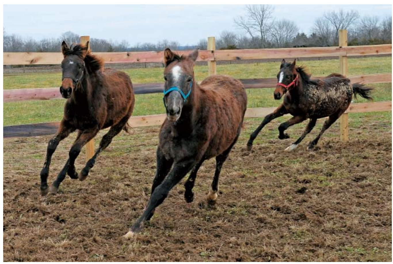
Weanlings stretch their legs at Still Creek Farm, which is located in southeastern Indiana

is pretty simple—you move in, you ship in, you take care of your horses, and that's it. But here, every day you've got to be doing something. If it's not grooming horses, it's fixing the barn, fencing, everything."