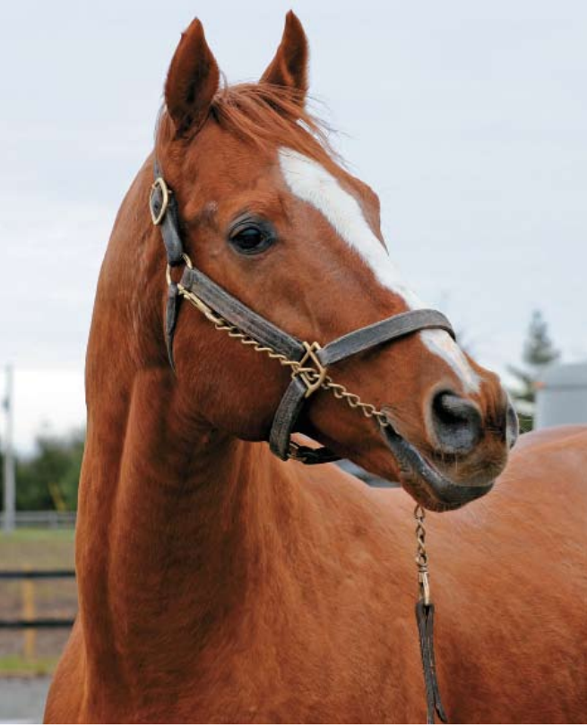
Unbridled America is a son of Unbridled's Song