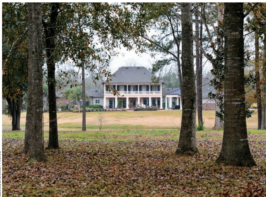
Coteau Grove Farm consists of 180 acres near Sunset, La.