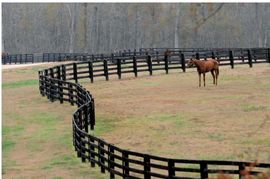
Lush paddocks have a 'freestyle fence design' that bends with the rolling hills

AVERAGE-EARNINGS INDEX and COMPARABLE INDEX: Lifetime AVERAGE-EARNINGS INDEX indicates how much purse money the progeny of one sire has earned in relation to the average earnings of all runners in the same years; average earnings of all runners in any year is represented by an index of 1.00; COMPARABLE INDEX indicates the average earnings of progeny produced from mares bred to one sire, when these same mares were bred to other sires. Only 32% of all sires have a lifetime AVERAGE-EARNINGS INDEX higher than their mares' COMPARABLE INDEX.