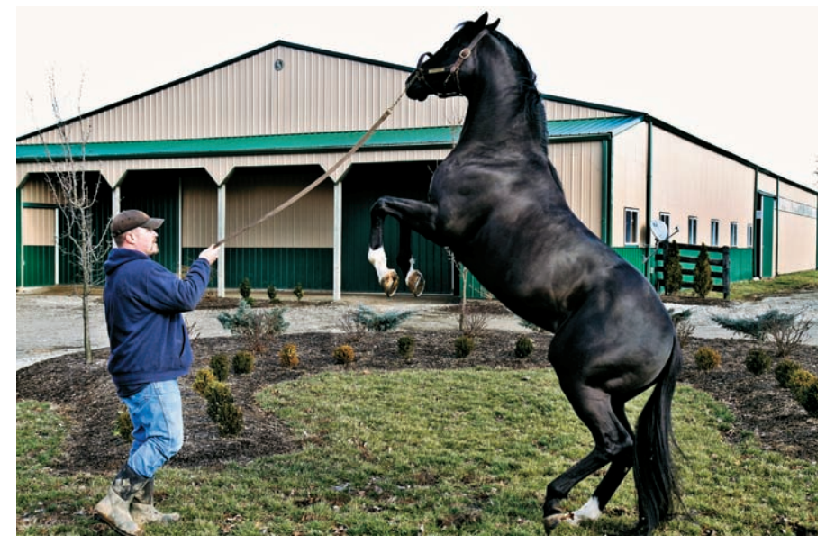
Star Cat (Storm Cat-Ashado) is a well-bred stallion standing at Breakway