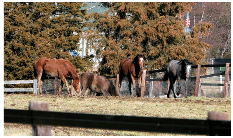
Fillies grazing in a pasture at Breakway

player in the breeding and racing business. Stallion awards for Indiana-based studs come in at 10% of the gross purse at the state's racetracks, with another 20% available in breeders awards. The state has rescinded a 20% award to owners that it had installed a short time before, but at one time if you had the stallion, the mare, and won a race, you were good for 110% of the purse. Still, the awards remain lucrative.