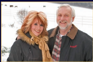
Suzie & Doc

Beautiful son of GIANT'S CAUSEWAY with first 2YO winners at SAR & BEL