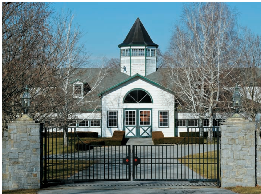
Entrance and signage at Vinery New York at Sugar Maple Farm