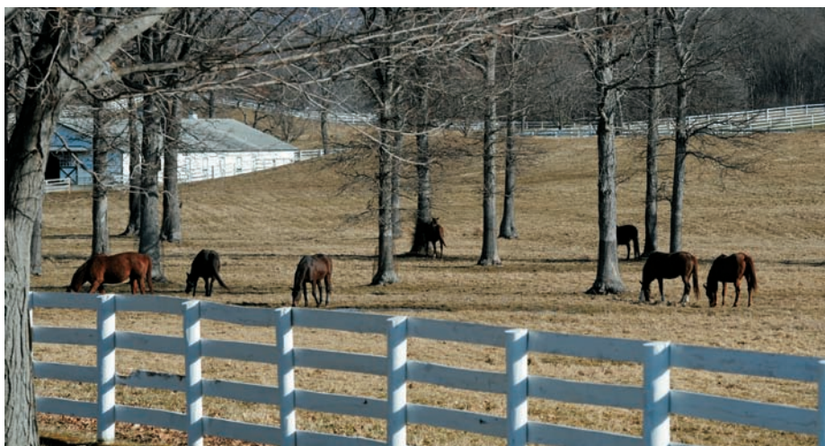
The 500-acre Sugar Maple Farm had the same architect as Vinery Kentucky