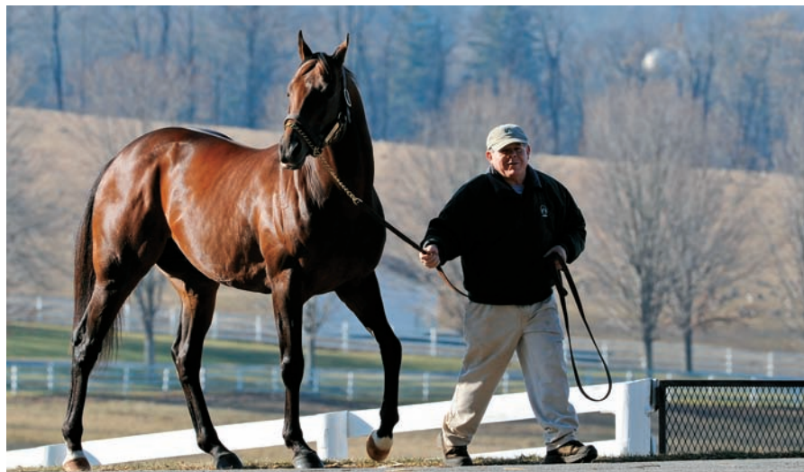
Bluegrass Cat has moved from Kentucky to New York for the 2012 breeding season

"New York is just getting bigger, and bigger, and bigger. If you and I buy a mare and put her in Louisiana, the upside is X; we buy that same mare and put her in Florida the upside is Y; we buy the same mare and put her in New York, it's X times Y. So that's the reason we made the move up there. We hedged that the timing was