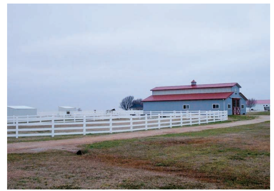
The foaling barn is surrounded by four paddocks and run-in sheds on Bigheart Thoroughbreds