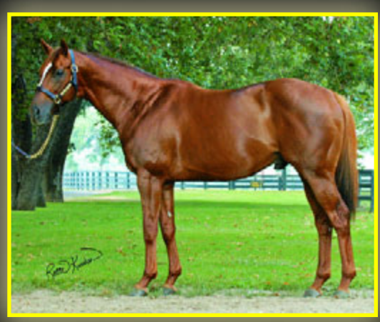
PROPERTY OF VESSELS STALLION FARM