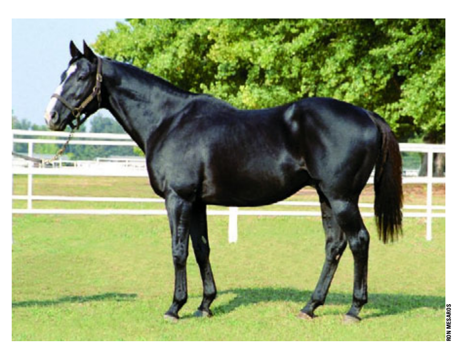
Unusual Heat stands at Old English Rancho

for us. He says, 'I want to claim this horse in this race.' It was $80,000, and we said, 'What are you smoking?' He said, 'Don't worry; I've got a partnership.' "