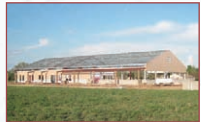
View Toward Veranda & Open Arena March 14, 2012