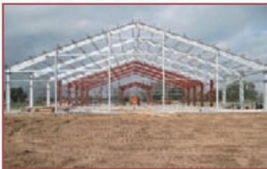
View Toward Open Arena February 28, 2012

Our company and facilities will host annual events, including two Yearling sales, a Fall Mixed sale and a Spring Two-Year-Old sale, with access to Copper Crowne's premier training track.