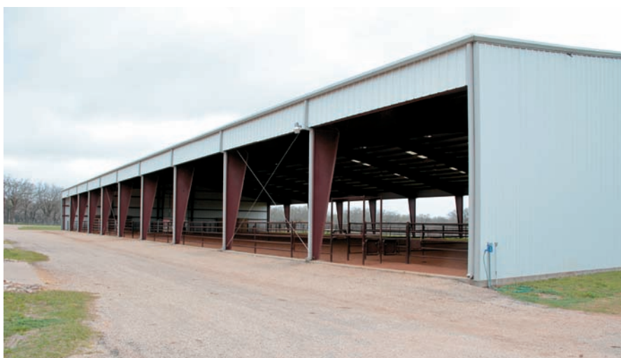
Barns are outfitted with airplane hanger-style doors to allow for circulation

*A-E and COMPARABLE INDEX: The lifetime Average-Earnings Index indicates how much purse money the progeny of one sire has earned, on the average, in relation to the average earnings of all runners in the same years; average earnings of all runners in any year is represented by an index of 1.00. The Comparable Index indicates the average earnings of progeny produced from mares bred to one sire, when these same mares were bred to other sires. Only 32% of all sires have a lifetime AEI higher than their mares Comparable Index.