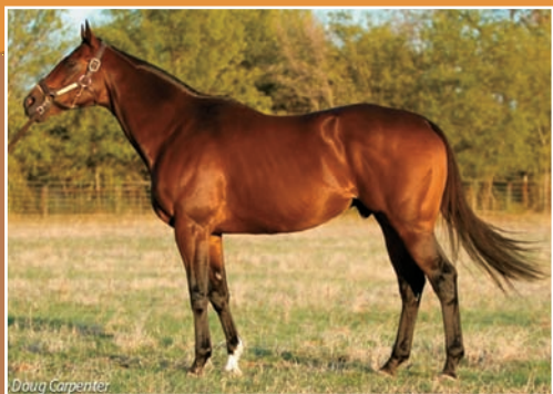
Read The Footnotes Smoke Glacken – Baydon Belle, by Al Nasr

Third Leading National Sire By 2012 Juvenile Sales Average*