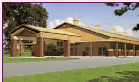
Artist's rendition of the new sales pavilion