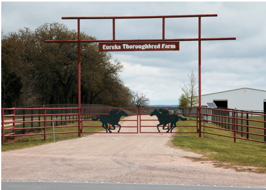
The entrance to Eureka Thoroughbred Farm

*A-E and COMPARABLE INDEX: The lifetime Average-Earnings Index indicates how much purse money the progeny of one sire has earned, on the average, in relation to the average earnings of all runners in the same years; average earnings of all runners in any year is represented by an index of 1.00. The Comparable Index indicates the average earnings of progeny produced from mares bred to one sire, when these same mares were bred to other sires. Only 32% of all sires have a lifetime AEI higher than their mares Comparable Index.