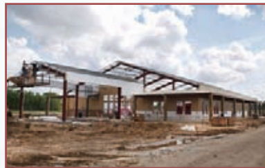
Building Construction Progress March 17, 2012