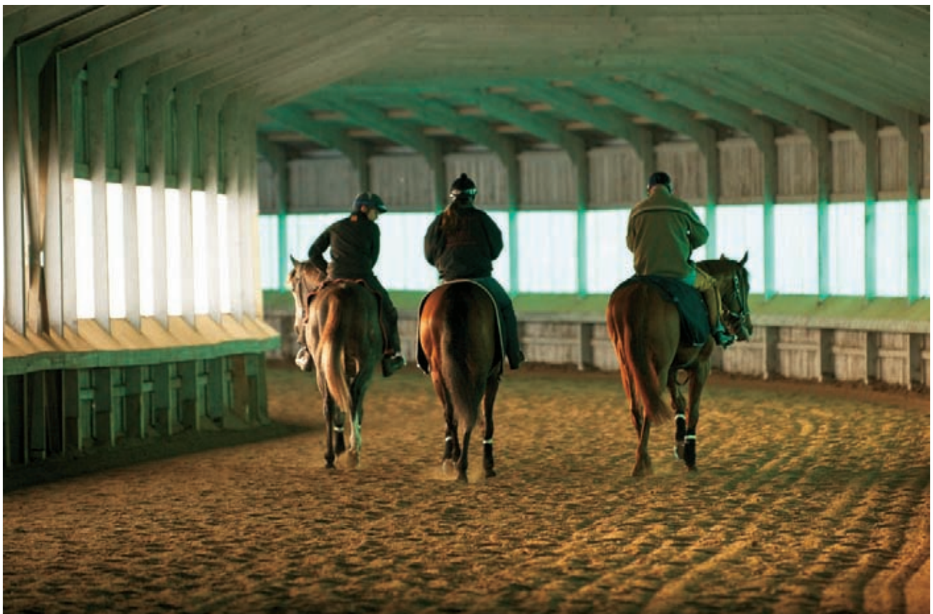
A half-mile indoor track allows for training regardless of the weather