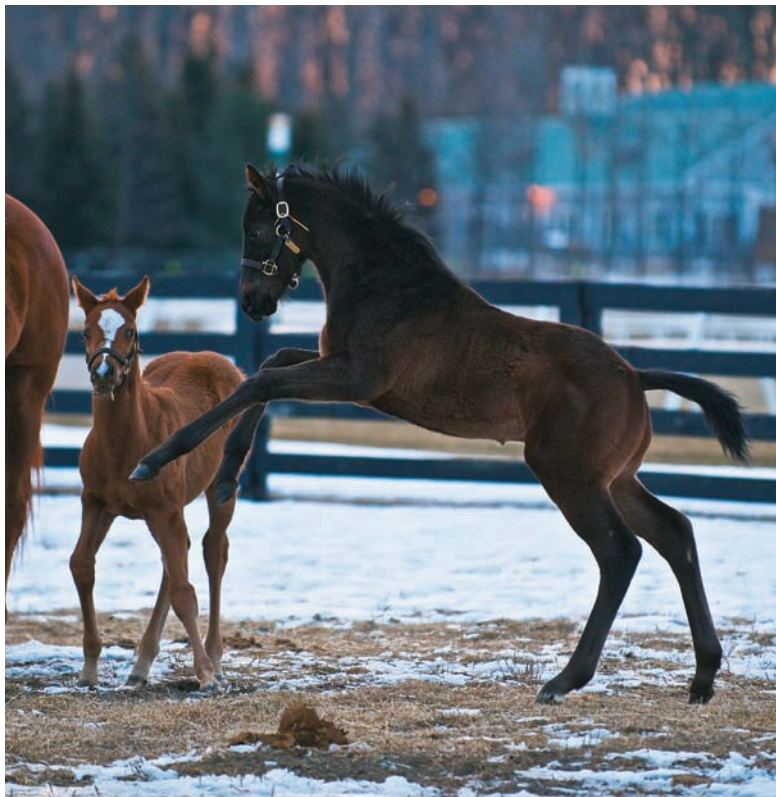
Foals frolic in a field on an early March day at Adena Springs Canada