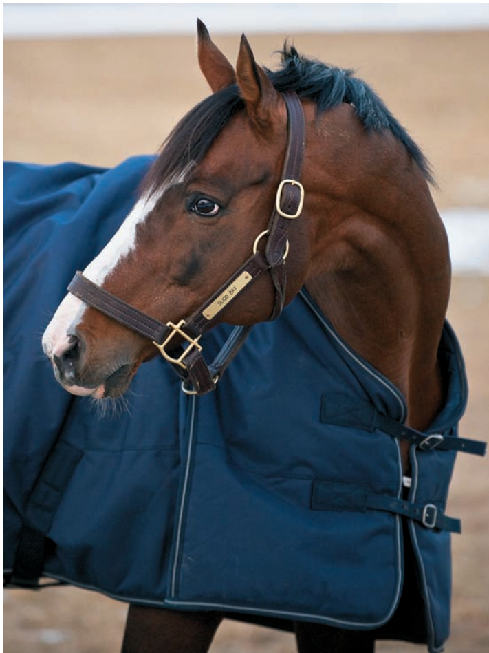
Adena Springs Canada stallion Sligo Bay

*A-E and COMPARABLE INDEX: The lifetime Average-Earnings Index indicates how much purse money the progeny of one sire has earned, on the average, in relation to the average earnings of all runners in the same years; average earnings of all runners in any year is represented by an index of 1.00. The Comparable Index indicates the average earnings of progeny produced from mares bred to one sire, when these same mares were bred to other sires. Only 32% of all sires have a lifetime AEI higher than their mares Comparable Index.