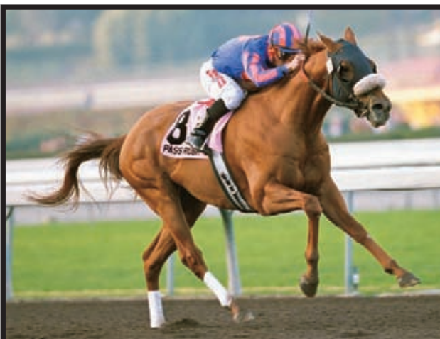
#1 SECOND-CROP SIRE IN THE MIDWEST

When one's breeding operation reaches the size that Stronach's has, measures must be taken to keep the numbers somewhat reasonable. To that end, Stronach has lately attempted to scale back his