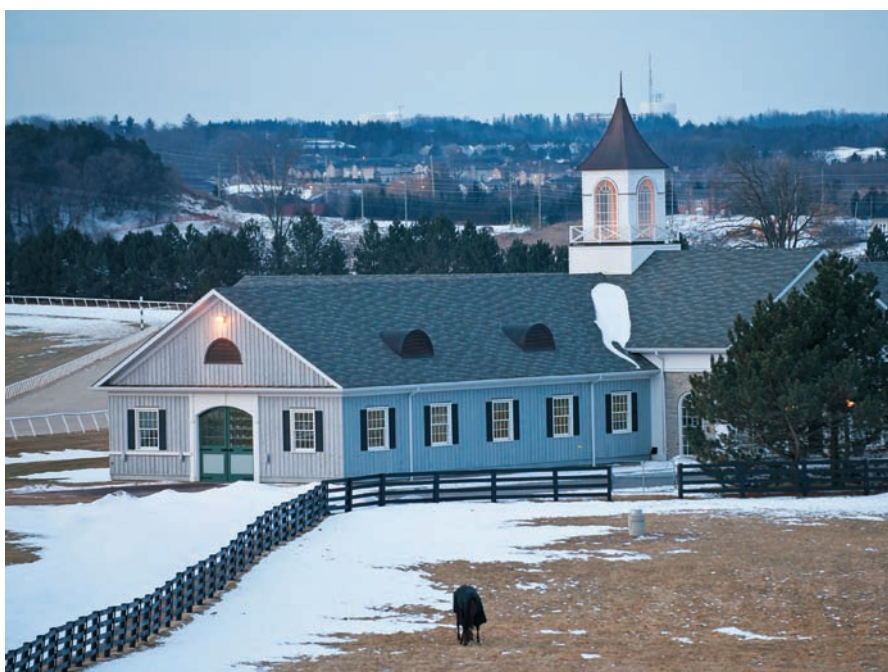
Adena Springs Canada spreads out over 330 acres

One thing that hasn't changed in the Ontario market, however, has been the commitment of Frank Stronach and his family to breeding and racing in the locale where Stronach founded his auto parts company, Magna, which he turned into an international conglomerate. The showplace farm that is Adena Springs Canada near Aurora, north of Toronto, is a testament to that commitment and serves the needs of three generations of the Stronach family.