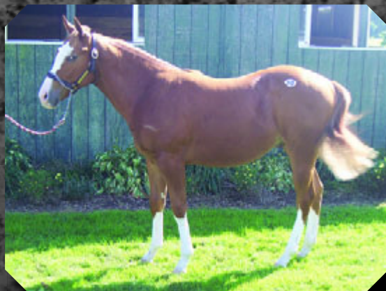
POSSE yearling colt Out of a two-year-old SW

The Pewter Stable has won hundreds of races and millions of dollars at the track this decade alone.