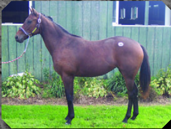
POSSE yearling filly Half sister to a $300,000 SW and 2YO stakes colt