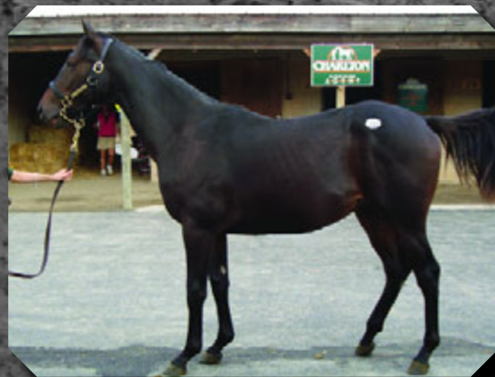
NOT FOR LOVE yearling colt Out of a half sister to a GSW and a 2YO SW