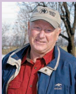
Dr. Warren Center