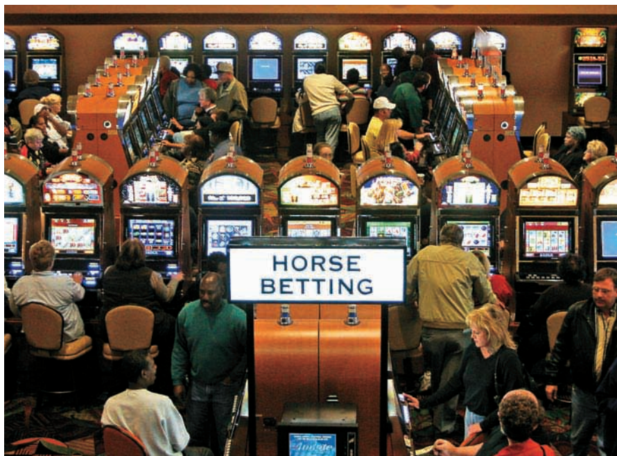
Remington Park Casino offers 750 electronic gaming machines

Oklahoma horse industry officials are in agreement that Remington Park would have shut its doors had it not been for the timely passage of the casino bill. Competition from the dozens of in-state Native American casinos had put both Remington and Will Rogers Downs near Tulsa in a position where they could no longer operate.