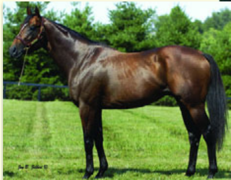
A Mill Ridge Farm Stallion

First foals race in 2009 2009 fee $6,000 LFSN