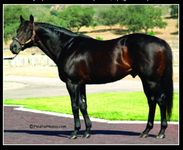
GRADE 1 STAKES WINNER OF $536,218 FROM 21 STARTS

THE LEADING SIRE IN CALIFORNIA BY NUMBER OF STAKES WINNERS WITH 62