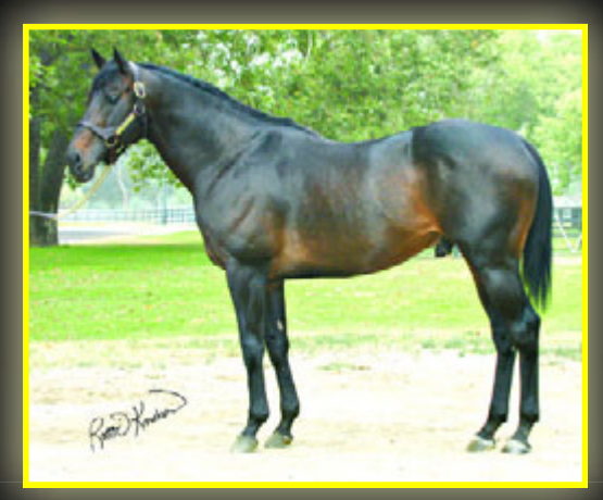
PROPERTY OF A SYNDICATE