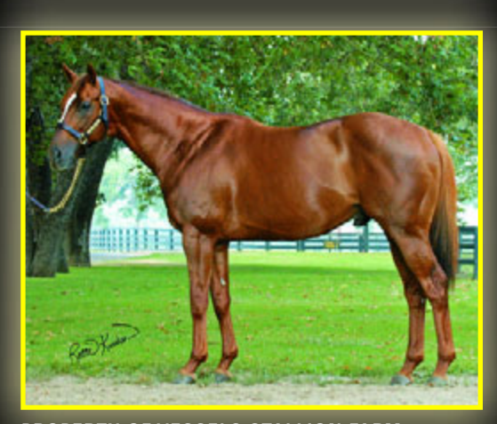
PROPERTY OF VESSELS STALLION FARM