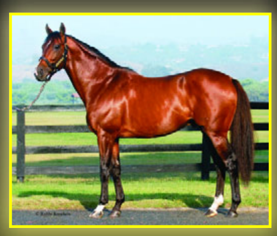
PROPERTY OF A PARTNERSHIP