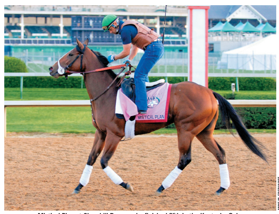
Mistical Plan at Churchill Downs; she finished fifth in the Kentucky Oaks

When asked how she had managed to produce such impressive results from a modest operation in a struggling West