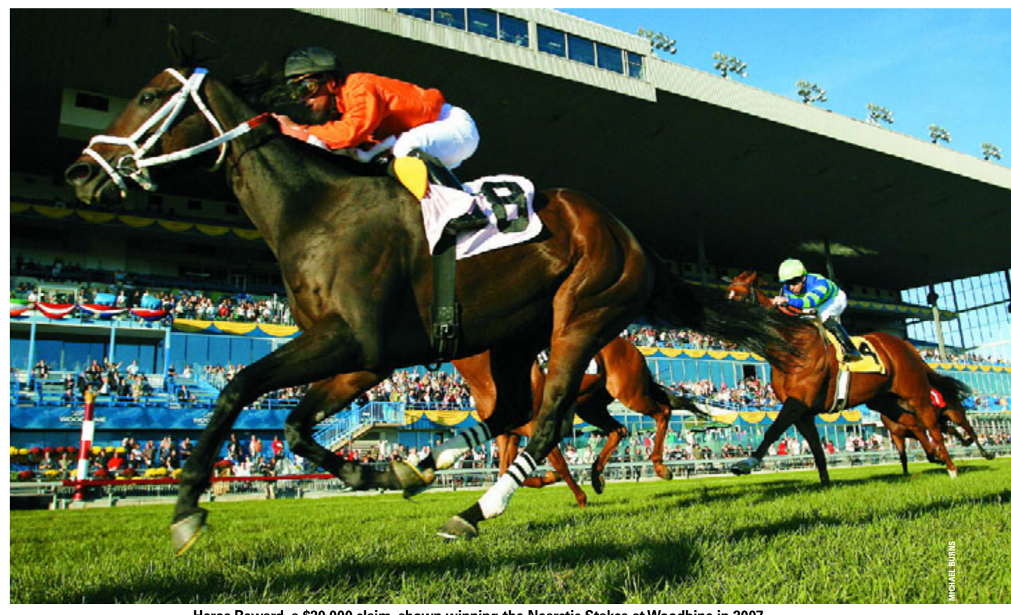
Heros Reward, a $20,000 claim, shown winning the Nearctic Stakes at Woodbine in 2007