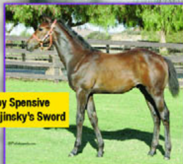
Colt by Spensive out of Nijinsky's Sword

RACETRACK SUCCESS = THE BEST PREDICTOR OF A SUCCESSFUL SIRE!