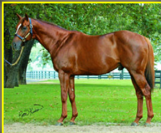
PROPERTY OF VESSELS STALLION FARM