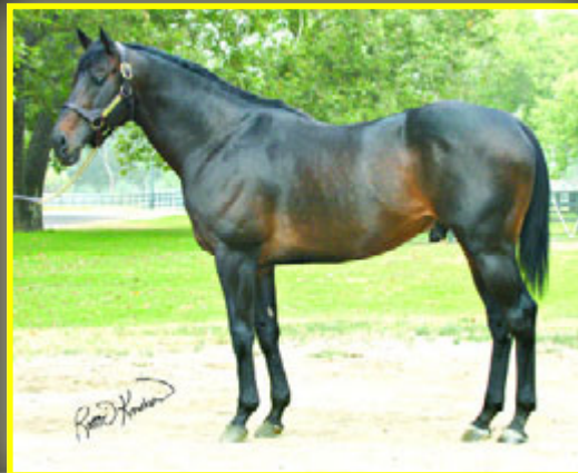
PROPERTY OF A SYNDICATE