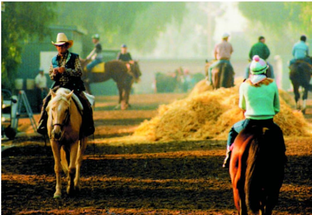
The Southern California-based Winners Foundation helps anyone in the racetrack industry battle substance abuse