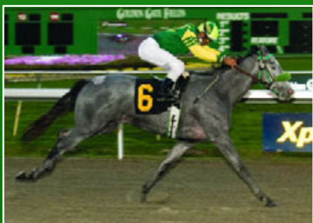
Marino's Marino's Golden Gate Allowance winner Merry Marino (at 2)

All Stallions are Breeders' Cup Eligible