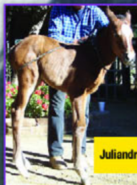
Juliandra '09 filly