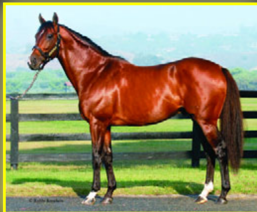
PROPERTY OF A PARTNERSHIP