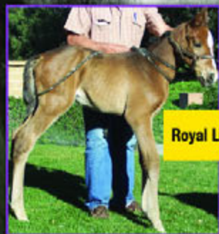
Royal Life '09 filly