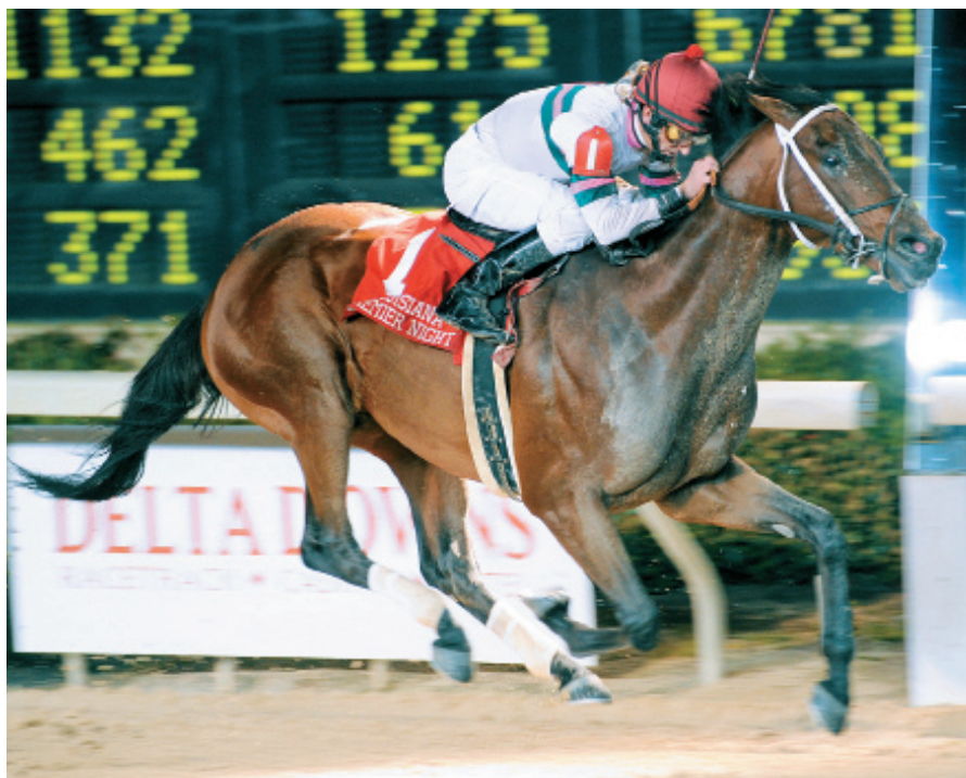
Star Guitar winning the Feb. 7 Louisiana Premier Night Championship