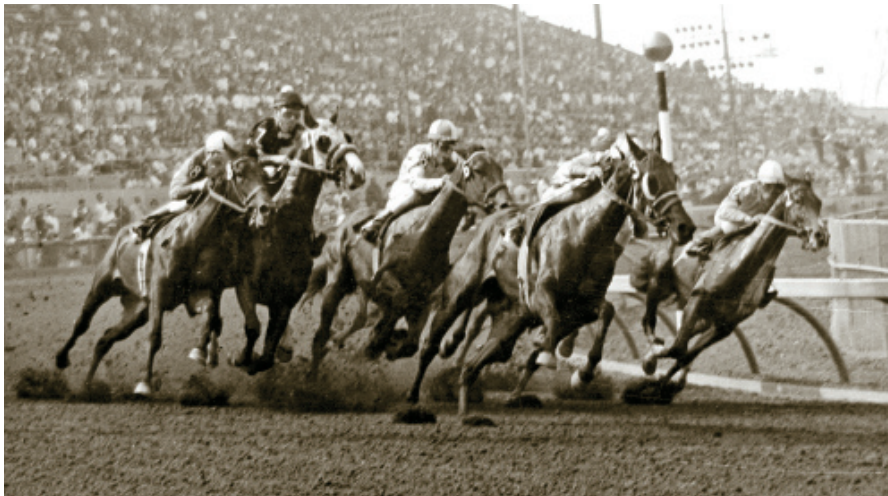
Fairplex is the oldest track running in Southern California