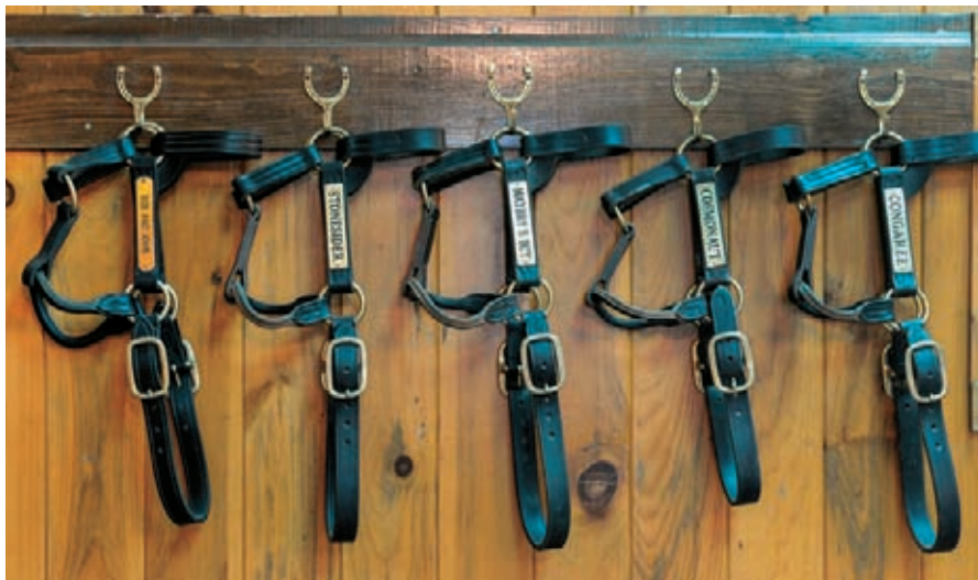
The roster at Highcliff Stallions at Mill Creek has expanded for the 2013 breeding season