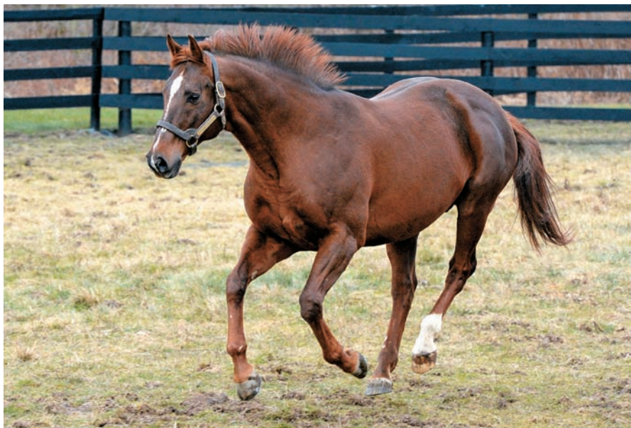
Congaree, among the top 10 sires in New York for 2012