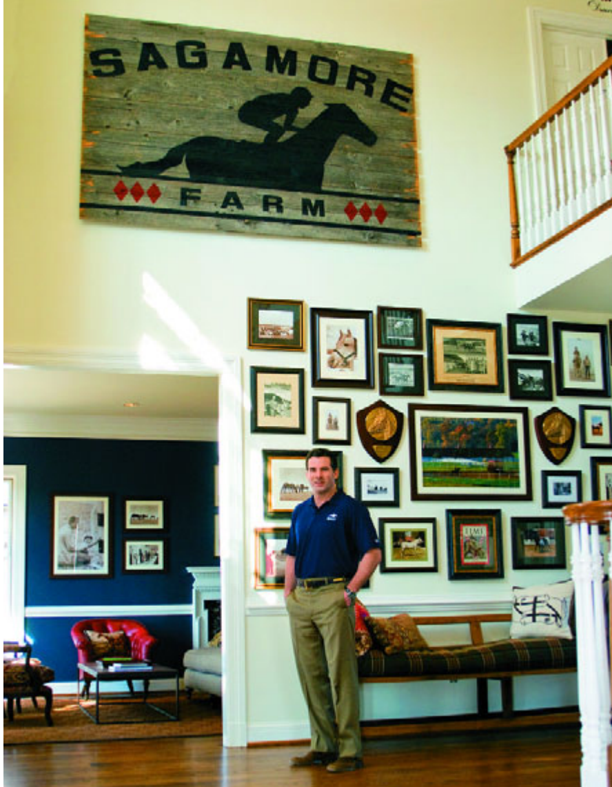
Plank's business slogan of "Protect This House" applies to the restoration going on at Sagamore

After graduating, Plank had one of those eureka moments. Why should football players wear those dank, clammy gray T-shirts under their pads? His answer was