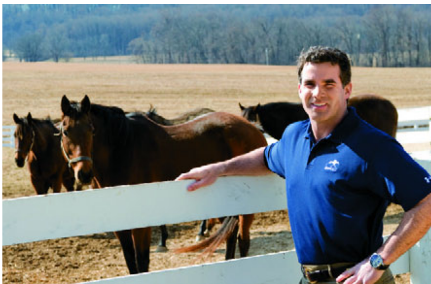
Under Armour founder Kevin Plank at his Sagamore Farm in Maryland

NORTHVIEW STALLION STATION . . pg 1085 www.northviewstallions.com