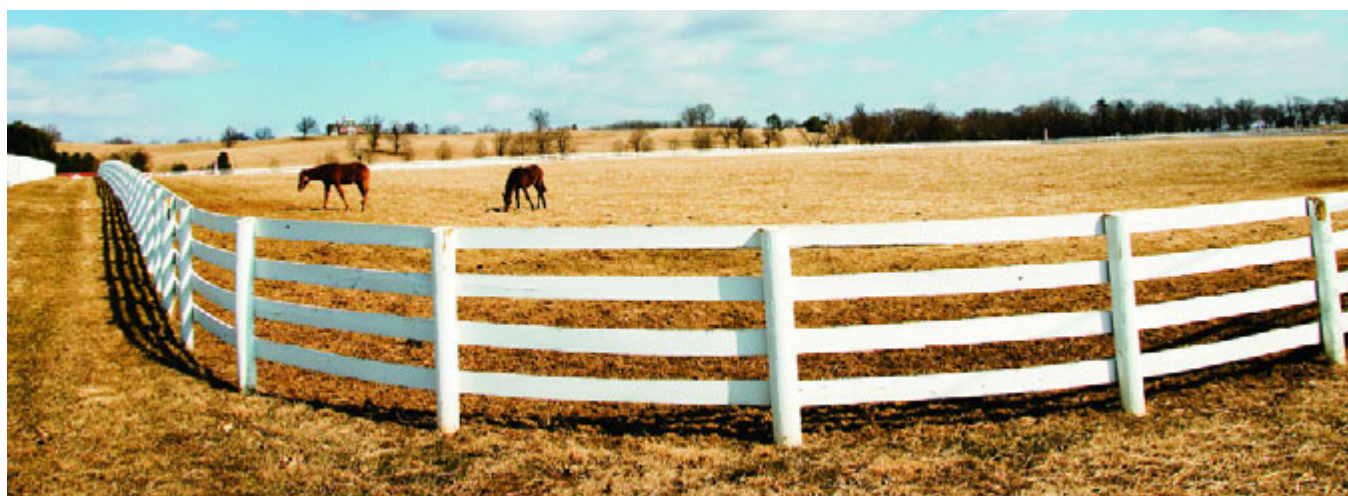
Plank's goal is to resurrect the 530-acre Sagamore Farm near Glyndon, Md.

Plank scored his first victory when a 2-year old filly named Bourbon Maid won