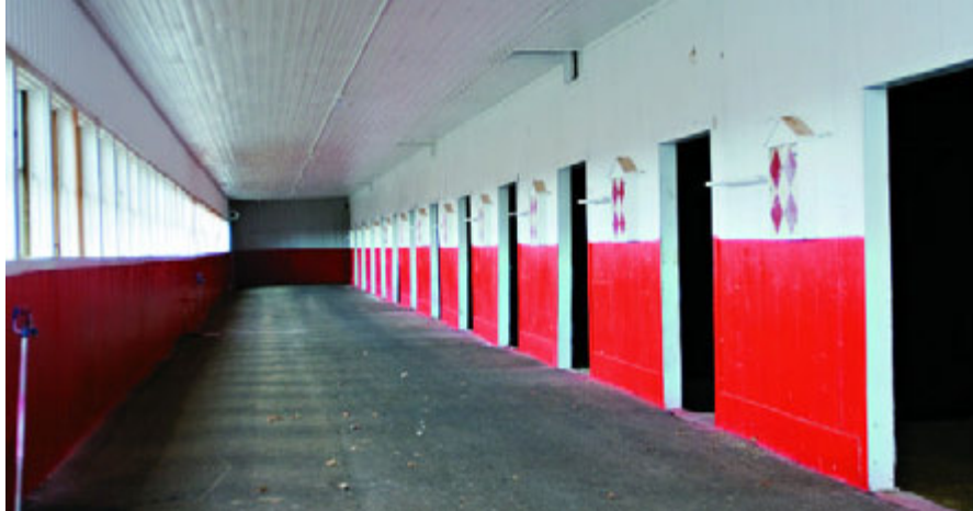
The barns at Sagamore have been refurbished