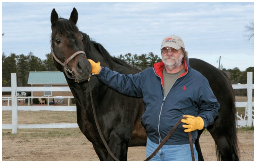
Hessee with grade I winner Brahms, the sire of 19 stakes winners

VLTs, we can't compete with neighboring states.