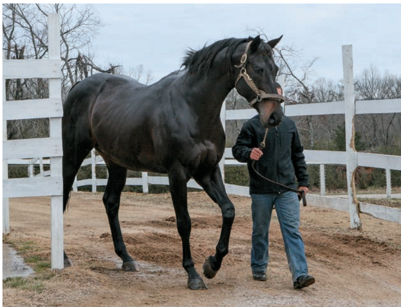
Super Derby winner The Daddy, a son of Valid Expectations, stands at Trophy Club