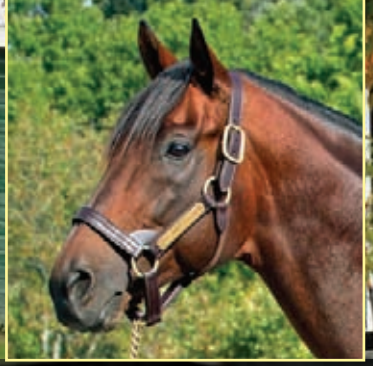
Distorted Humor-Justenuffheart, by Broad Brush | $5,000 Live Foal