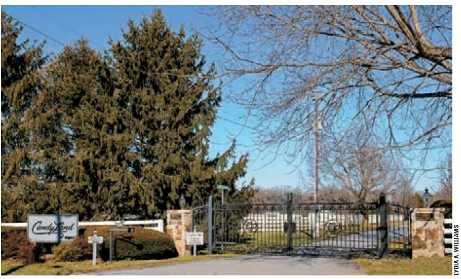
The entrance to Candyland Farm

*AVERAGE-EARNINGS INDEX and COMPARABLE INDEX: Lifetime AVERAGE-EARNINGS INDEX indicates how much purse money the progeny of one sire has earned in relation to the average earnings of all runners in the same years; average earnings of all runners in any year is represented by an index of 1.00; COMPARABLE INDEX indicates the average earnings of progeny produced from mares bred to one sire, when these same mares were bred to other sires. Only 32% of all sires have a lifetime AVERAGE-EARNINGS INDEX higher than their mares' COMPARABLE INDEX.