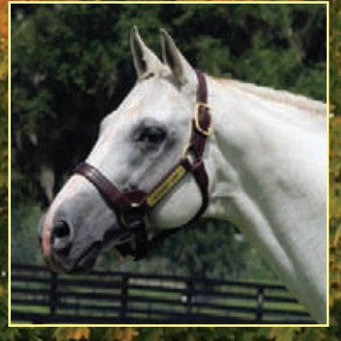
ALPHABET SOUP Cozzene-Illiterate, by Arts and Letters $6,000 Live Foal