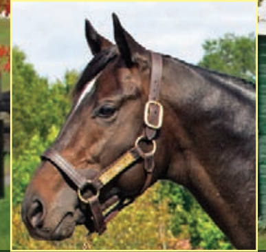
HERE COMES BEN Street Cry (IRE)-Chasetheragingwind, by Dayjur | $7,500 Live Foal