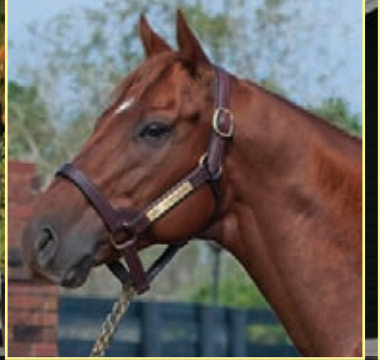
MR. SEKIGUCHI Storm Cat - Welcome Surprise, by Seeking the Gold | $2,500 Live Foal