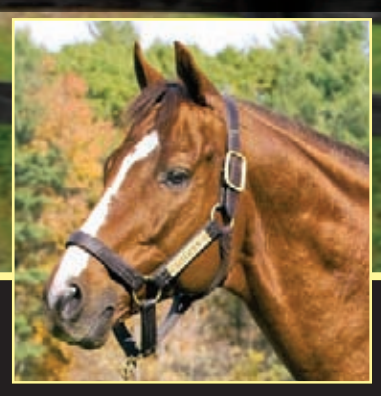
UTOPIA Forty Niner-Dream Vision, by Northern Taste | $5,000 Live Foal