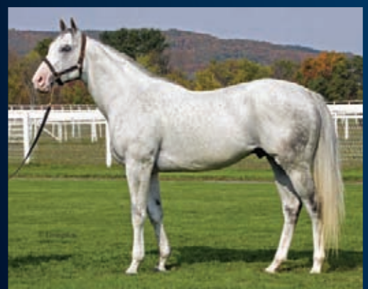
MAYBRY'S BOY Broad Brush - Aly's Conquest $3,500