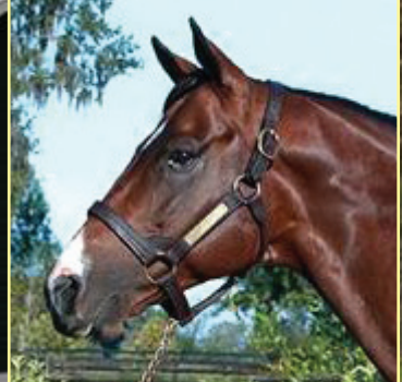
TEUFLESBERG Johannesburg-St.Michele, by Devil's Bag $5,000 Live Foal