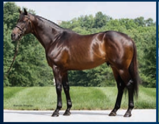
BOBAND JOHN Seeking the Gold - Minister's Melody $6,000

HIGHCLIFF Stallions' race records allow breeders the opportunity to maximize their potential to succeed in the lucrative New York Breeding and Racing Program