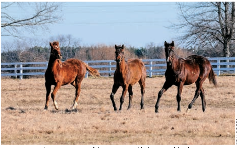
Yearlings romp in one of the spacious paddocks at Candyland Farm

"I sold my equipment leasing and security systems business to an English com-