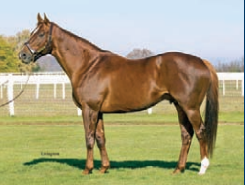
CONGAREE Arazi – Mari's Sheba $7,500