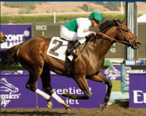
SMART BID Smart Strike - Recording $4,500