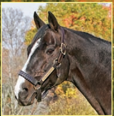
Storm Cat-Diamond City, by Mr. Prospector $5,000 Live Foal