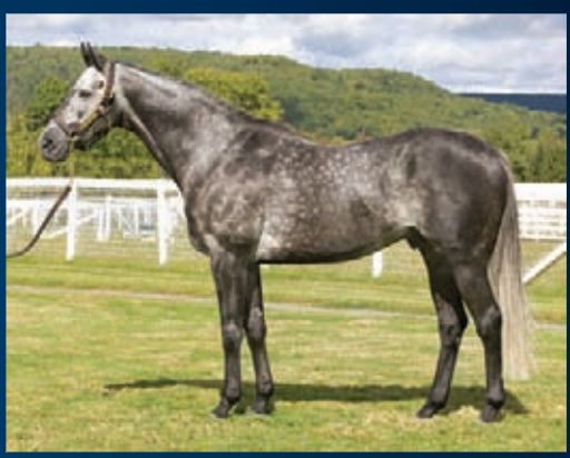
COSMONAUT Lemon Drop Kid - Cosmic Fire $5,000