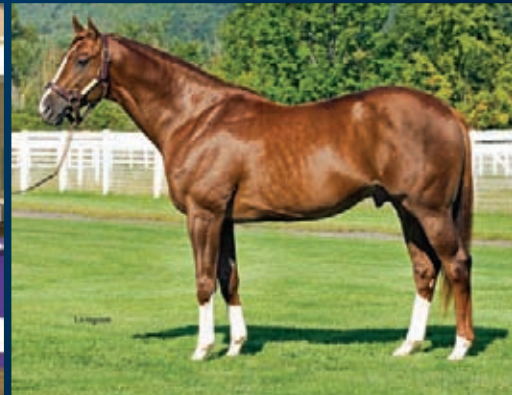
STONE SIDER Giant's Causeway – Added Gold Private