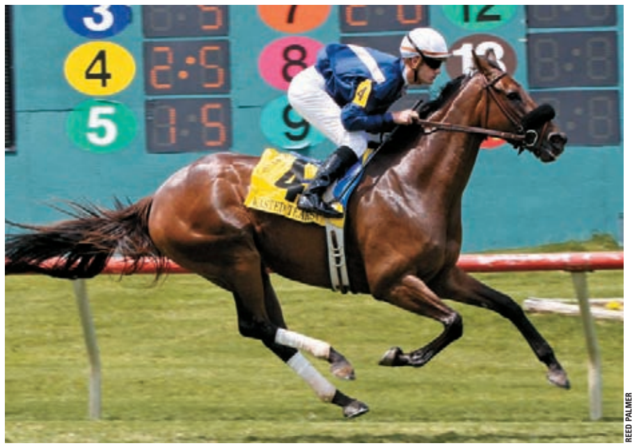
Wasted Tears, a winner of 12 stakes and $941,463

Despite the name, polo ponies are in fact Thoroughbreds that are, as a whole, smaller than the horses we watch compete at