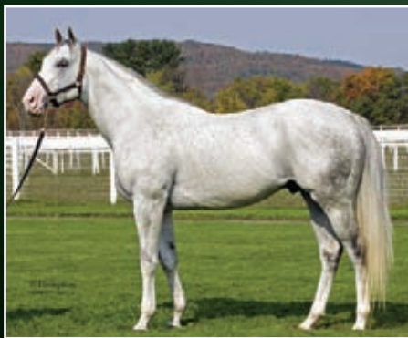
MAYBRY'S BOY | $3,500