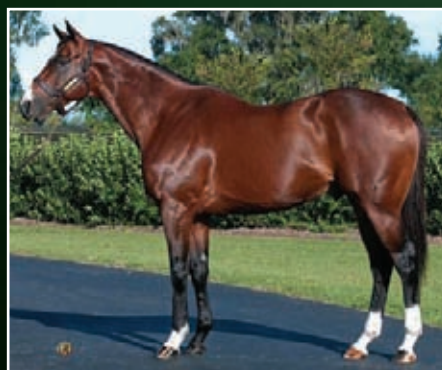
TEUFLESBERG | $5,000