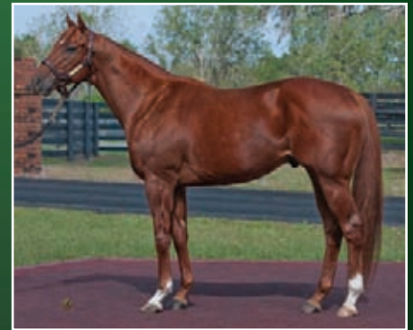
MR. SEKIGUCHI | $2,500