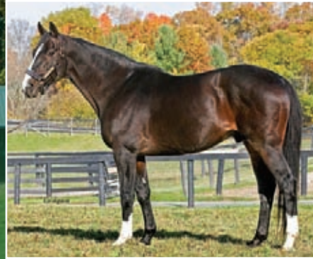
CATIENUS | $5,000