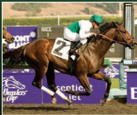
SMART BID | $4,500