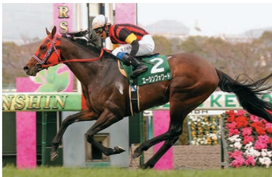
A Shin Forward winning the 2010 Japan Mile Championship