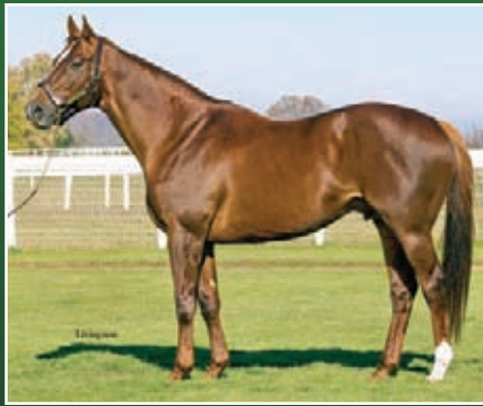
CONGAREE | $7,500