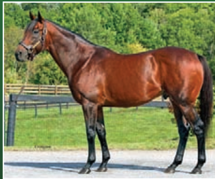
JUSTENUFFHUMOR | $5,000