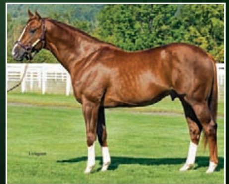
STONESIDER | Private