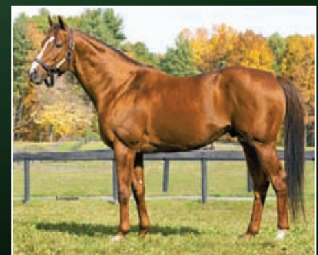
UTOPIA | $5,000