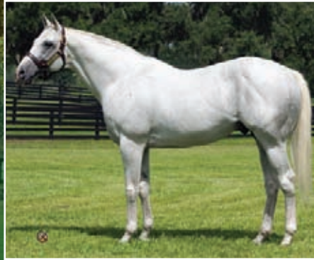
ALPHABET SOUP | $6,000