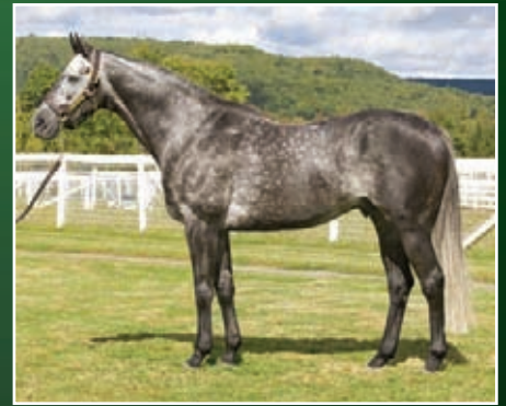
COSMONAUT | $5,000