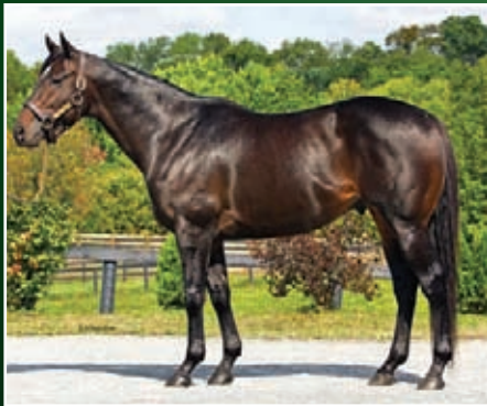
HERE COMES BEN | $7,500