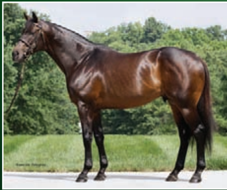
BOB AND JOHN | $6,000