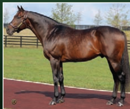
TOUCH GOLD | $7,500