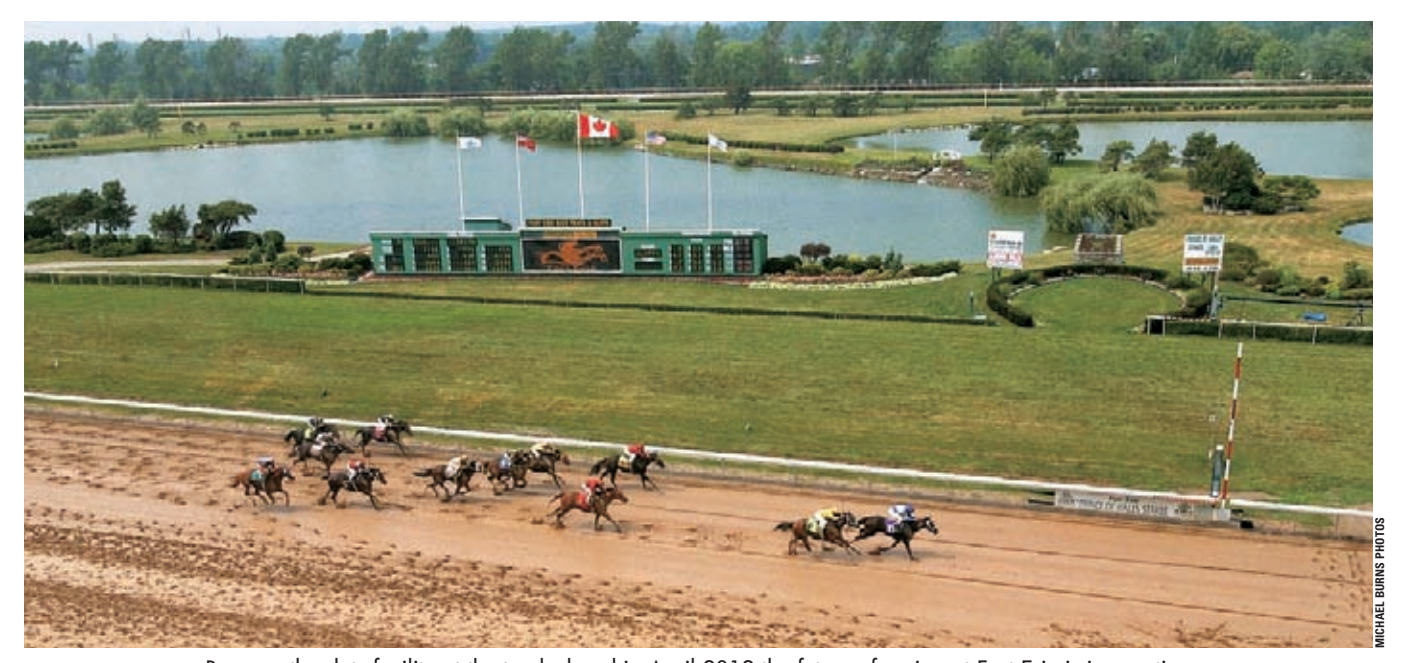
Because the slots facility at the track closed in April 2012 the future of racing at Fort Erie is in question

Fort Erie Racetrack, on the other hand, which just completed its 115th season of live racing in 2012, is in a much different position.