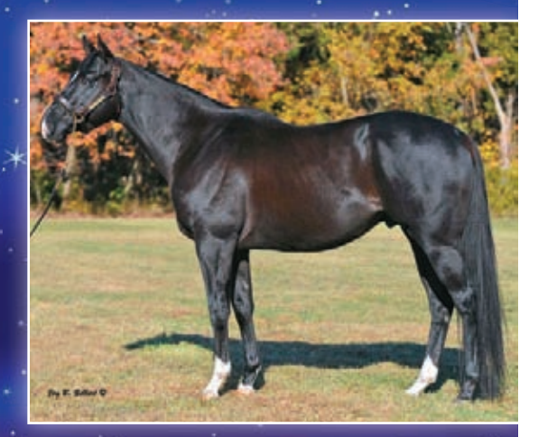
STORM CAT-ASHADO, BY SAINT BALLADO

Breeders' Cup & Indiana Nominated | Property of Cedar Creek Ranch