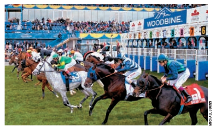
Woodbine is home to top races such as the Canadian International

grade I winner from breeders had the slots program not been cancelled.