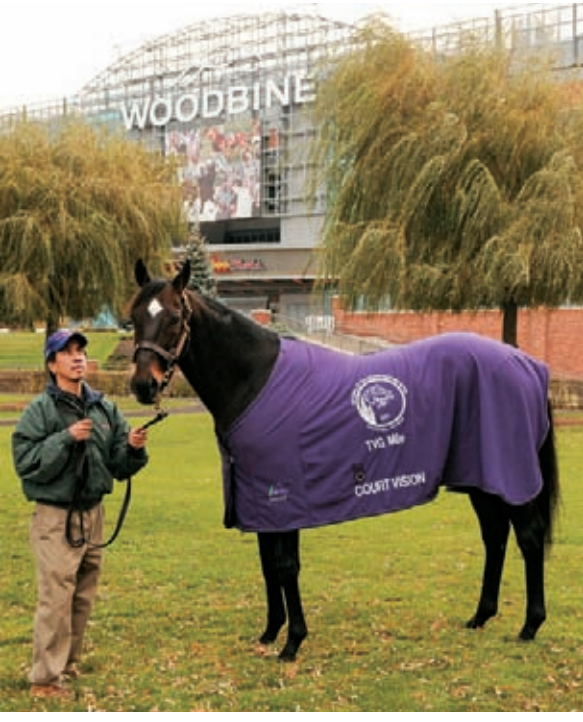
Stallion Court Vision at Woodbine in 2011