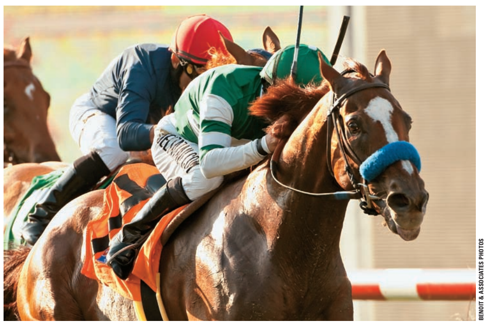
Vagabond Shoes winning the Del Mar Handicap

ing, Lady of Shamrock defeated older distaffers in the Santa Barbara Handicap (gr. IIT; winning by disqualification). She even traveled to Belmont Park for the New York Stakes (gr. IIT), where she finished second to Starformer.