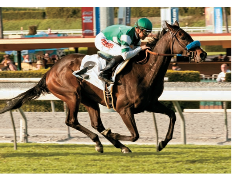
Stable star Lady of Shamrock

Demetri preferred to name a horse rather than having one named for him. \,