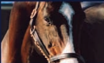
DOUBLE HONOR stalwart sire

Gone West - Holiday Snow, by Storm Bird Fee: $2,500 LF/SN