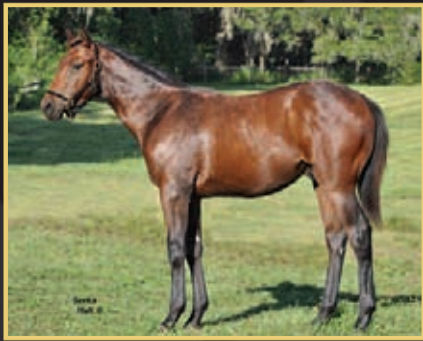
Colt by First Dude out of Spoken For