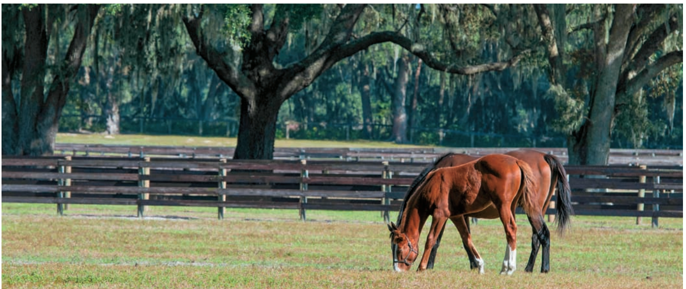
The broodmare band at Northwest Stud numbers 75, up from 40 when the farm opened

“I like to compare the Thoroughbred breeding business to the automobile business,” he added. “If you don't provide outstanding customer service as an auto dealer, you don't sell cars. It's the same with horses. We try to offer the best customer