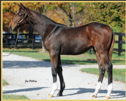
Colt by First Dude out of Placerita