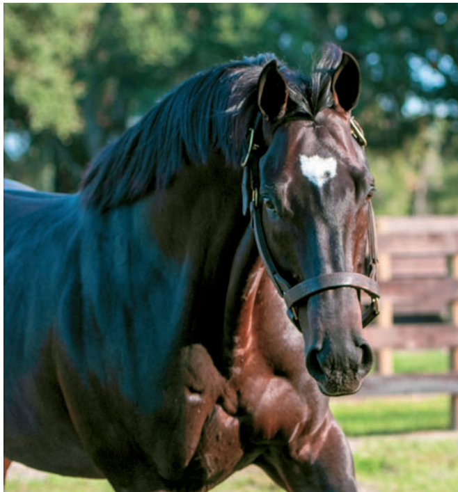
Gone Astray, a son of Dixie Union, covered 119 mares in 2013

Having invested in higher-quality stock with the farm's recent yearling purchas-