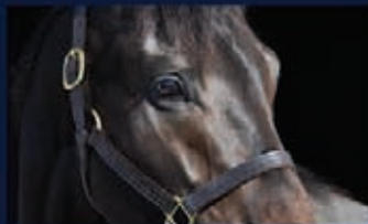
TWO STEP SALSA national leader

Gone West - Holiday Snow, by Storm Bird Fee: $2,500 LF/SN