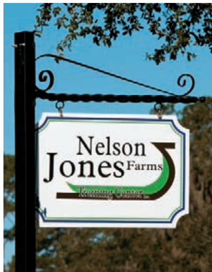
Northwest Stud is located inside the Nelson Jones Training Center

lions, including three new stallions for 2014. Wrote, Duke of Mischief, and Turbo Compressor join the roster anchored by Gone Astray. Also standing at the farm are Flashstorm, United States, and Pleasant Strike.