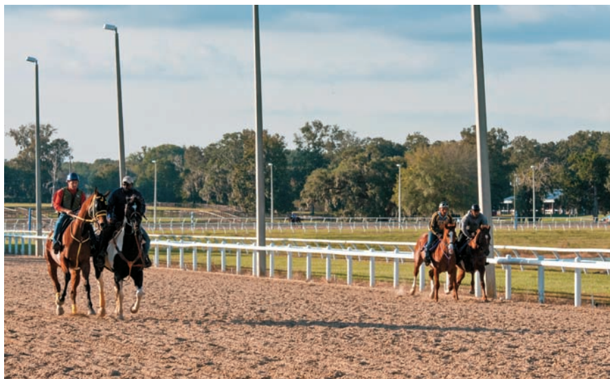
The training track, which has lights, is a one-mile layout

service we possibly can. We are interested in forming long-term relationships. Without the support of breeders, we don't have a business."