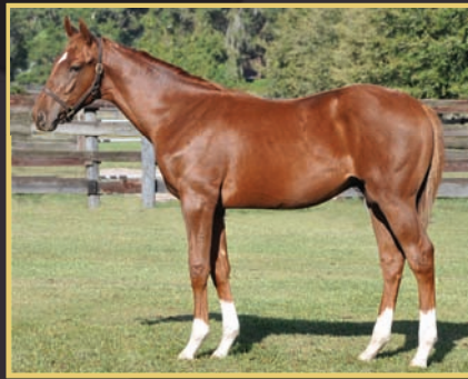
Colt by First Dude out of British Event