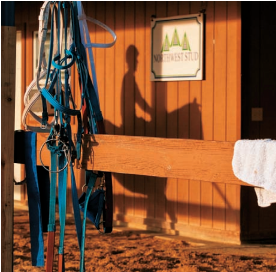
The training center has 17 barns that can house 400 horses