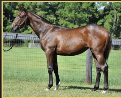
Filly by First Dude out of Double Martini

"If this is representative of First Dude's foals, people should be flocking to him to fill his book"