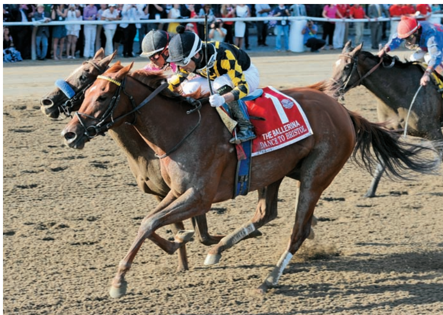
Dance to Bristol winning the grade I Ballerina at Saratoga