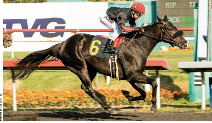
Lucky Views breaking his maiden Nov. 17 at Betfair Hollywood Park

ever, he spends whatever is required to keep it sound and healthy.