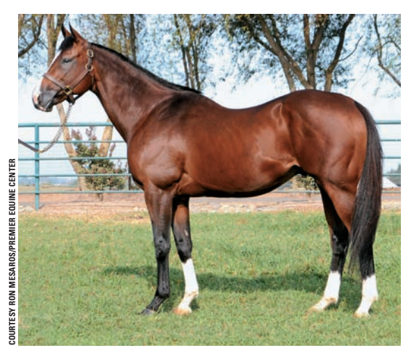
Sway Away will stand for $2,500 in 2014

Metanovic will manage the matings for Smiling Tiger. He did some shopping at the Keeneland November breeding stock sale and has a number of well-bred mares—purchased in foal in the $50,000-