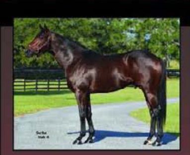
POSEIDON'S WARRIOR Speightstown Brilliant G1 SW Sprinter Defeated Shackleford (G1) Fee: $6,500 LF/SN