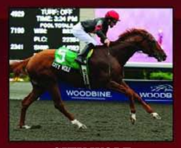
CITY WOLF Giant's Causeway Graded SW half-brother to CITY ZIP and GHOSTZAPPER Fee: $4,000 LF/SN