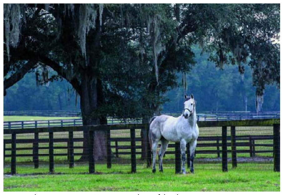
Grade I winner Discreet Marq is a graduate of the Pleasant Acres training center

place at Pleasant Acres at age 9 after recording 14 wins in 52 starts and amassing earnings of $2,694,599. He won the 2009 Clement L. Hirsch Memorial Turf Championship Stakes (gr. IT) at Santa Anita and the 2008-09 editions of the United Nations Stakes (gr. IT) at Monmouth Park. Also numbered among his graded stakes triumphs were the W.L. McKnight Handicap (gr. IIT) at Calder Race Course in 2007-08, the 2008 Pan American Handicap (gr. IIIT), and the 2007 Cliff Hanger Stakes (gr. IIIT). He also won the 2009-2010 renewals of the Mac Diarmida Stakes (gr. IIT) at Gulfstream Park.