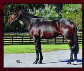
TREASURE BEACH (GB) Galileo (IRE) G1 Winner of $2.4 Million By Global Leading Sire Fee: $10,000 LF/SN