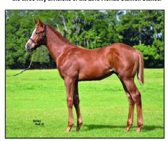
Colt, first foal out of Blue Eyed Sweetie, by West Acre - multiple stakes winner of $181,273.

"Our uncle is the industry-leading sire WAR FRONT who stands for $150,000.