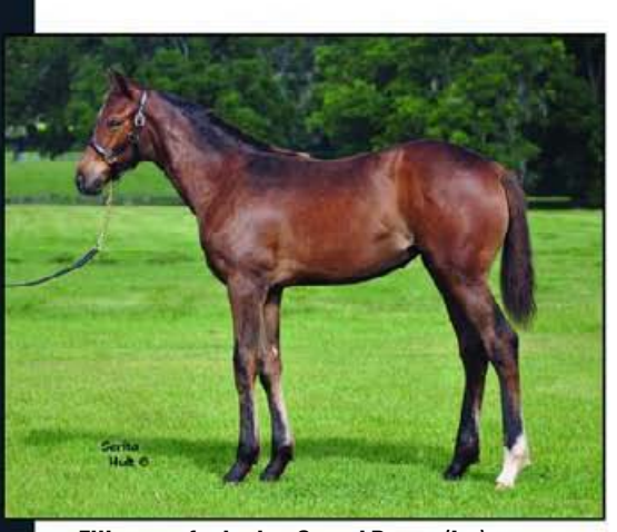
Filly, out of winning Sword Dance (Ire) mare, Queen Geraldine.