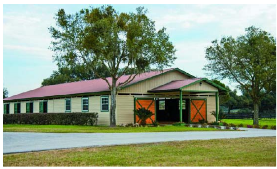
The stallion barn at Pleasant Acres