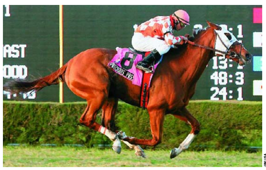
Barbazon-bred and raised Presious Passion earned more than $2.6 million

In 2009, the same year Presious Passion was named Florida horse of the year,