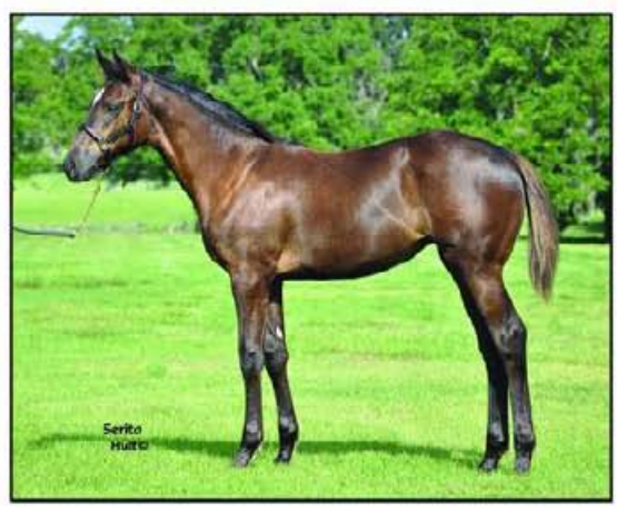
Filly, out of Seductive Lady (Langfur) multiple stakes producer and dam of 2YO multiple SW SCANDALOUS ACT who swept the three filly divisions of the 2013 Florida Stallion Stakes.