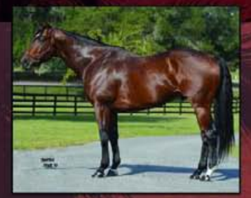
ANTHONY'S CROSS Indian Charlie G2SW by a Champion Sire Defeated champion Tapizar Fee: $2,500 LF/SN