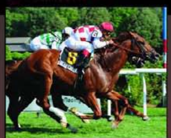
BEAU CHOIX Elusive Quality Multiple SW of 7 races / G1SP Out of G2SW half-sister to OCTAVE (G1) Fee: $2,500 LF/SN