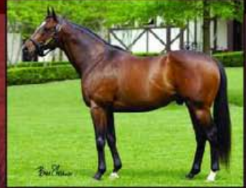
POLLARD'S VISION Carson City Millionaire Multiple GSW Sire of Champion 3yo filly BLIND LUCK Fee: $5,000 LF/SN