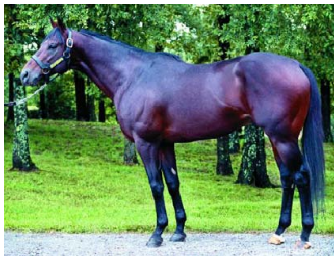
Hamazing Destiny's 2014 fee is $1,000