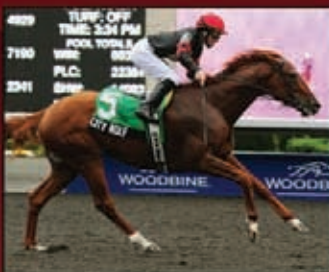
CITY WOLF Giant's Causeway Graded SW half-brother to CITY ZIP and GHOSTZAPPER Fee: $4,000 LF/SN