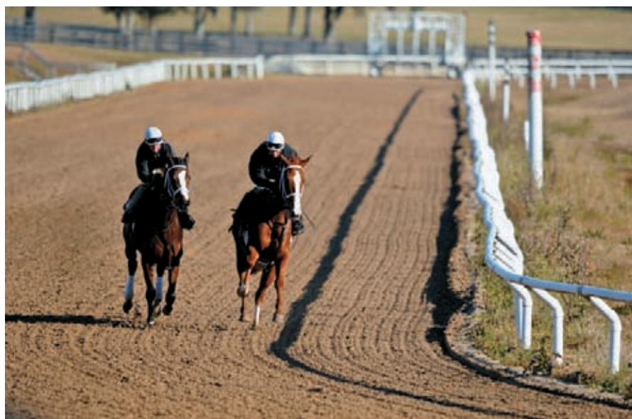
Bridlewood's training center is a key component to the 800-acre full-service facility