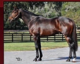
TREASURE BEACH (GB) Galileo (IRE) G1 Winner of $2.4 Million By Global Leading Sire Fee: $10,000 LF/SN