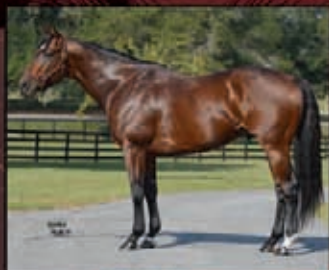
ANTHONY'S CROSS Indian Charlie G2SW by a Champion Sire Defeated champion Tapizar Fee: $2,500 LF/SN