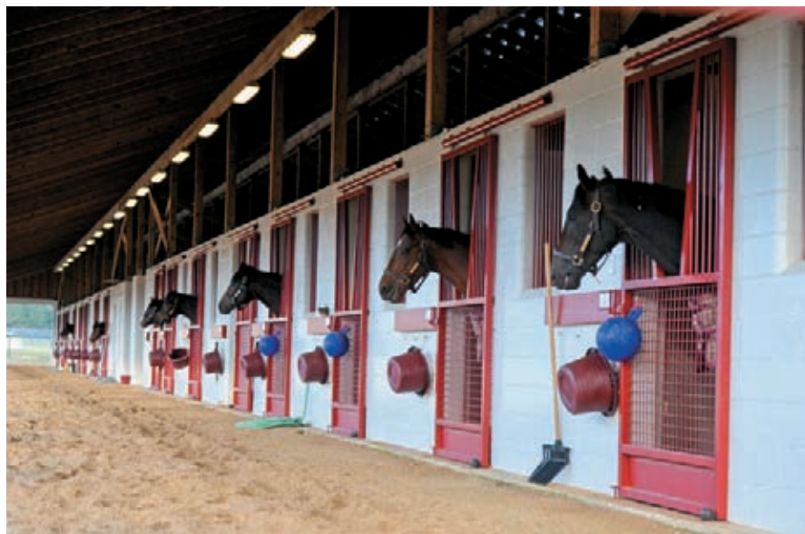
Developing a successful racing program is part of the plan for Bridlewood

hasn't lost his touch. It was fun to spend an afternoon at the races again and to visit with other owners and breeders and watch them win races. It was an exciting atmosphere, and it was a lot of fun."