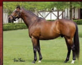
POLLARD'S VISION Carson City Millionaire Multiple GSW Sire of Champion 3yo filly BLIND LUCK Fee: $5,000 LF/SN