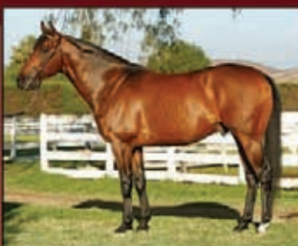
PASSION FOR GOLD Medaglia d'Oro 2YO G1 Winner / HWT colt in France Prolific female family Fee: $5,000 LF/SN