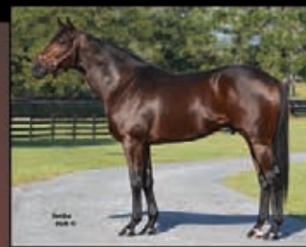
POSEIDON'S WARRIOR Speightstown Brilliant G1 SW Sprinter Defeated Shackelford (G1) Fee: $6,500 LF/SN