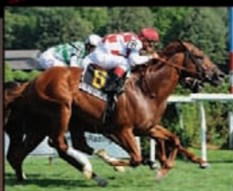
BEAU CHOIX Elusive Quality Multiple SW of 7 races / G1SP Out of G2SW half-sister to OCTAVE (G1) Fee: $2,500 LF/SN