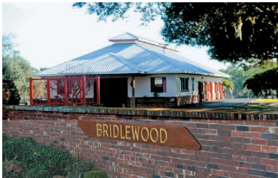
The stallion barn will be home to five stallions for the 2014 breeding season

require time for all the moving parts to settle into place.