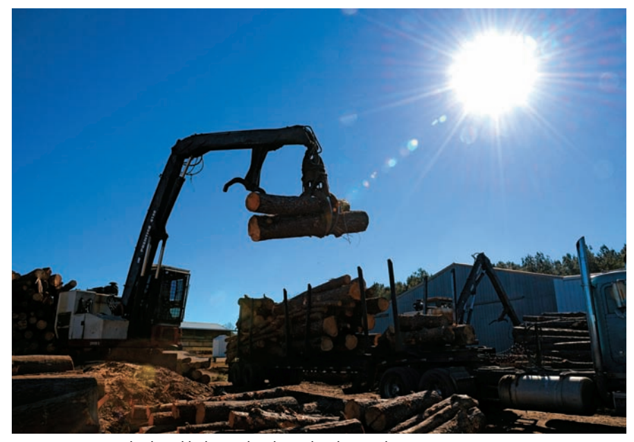
The knuckle-boom loader unloads pine logs at S & S Farms

the state and surrounding territory of Mississippi, East Texas, and western Alabama are part of S & S Farms' customer base. The rural feed store operations (approximately 90 stores) hold a special place in Smith's heart.