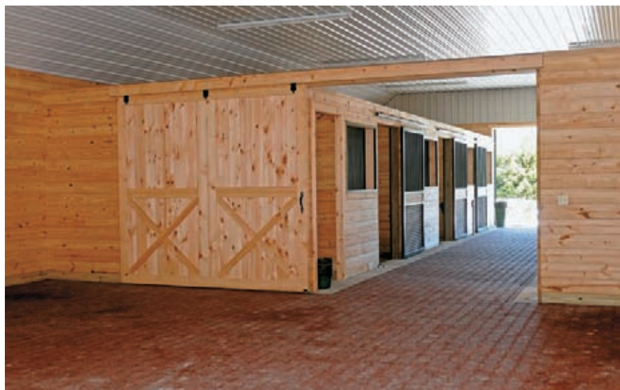
The brand new stallion barn at Heritage Stallions