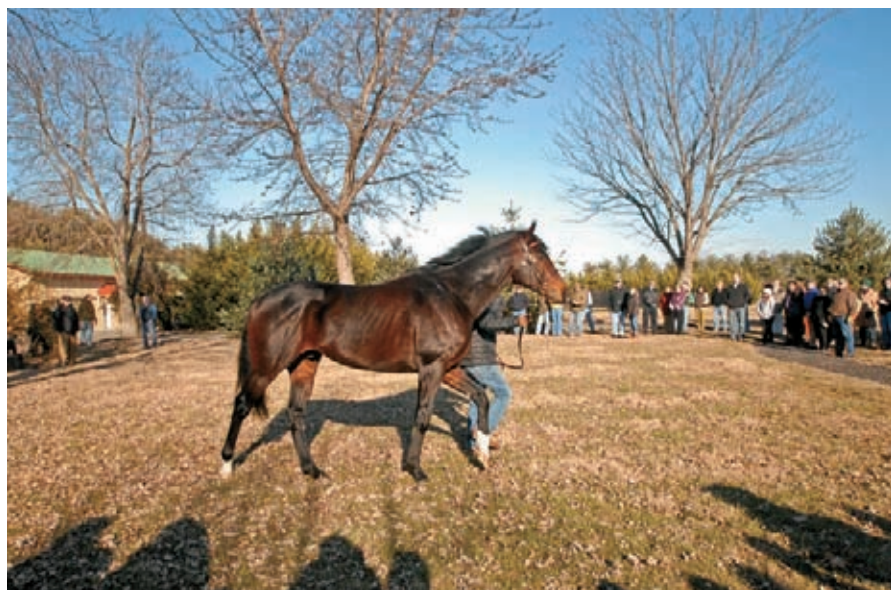
Hunters Bay on display at the Heritage Stallions open house earlier this year