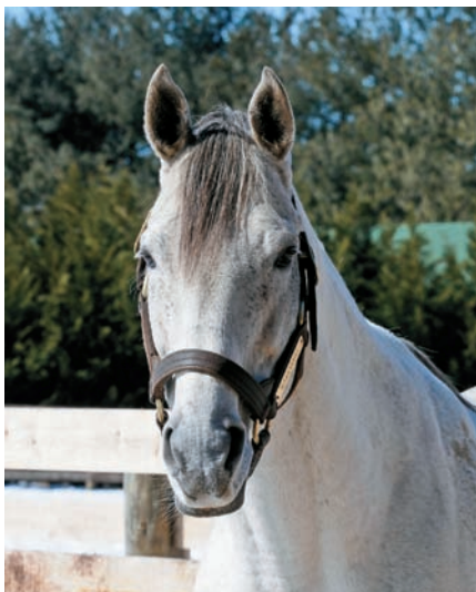
2005 Kentucky Derby winner Giacomo stands at Heritage Stallions

"I used to run both Northview farms and contracts would just roll in to the Pennsylvania farm in January," he said. "You had to have a handle on where you could be. I really don't think the Maryland guys are that worried about January and February foals. The Maryland farm con-